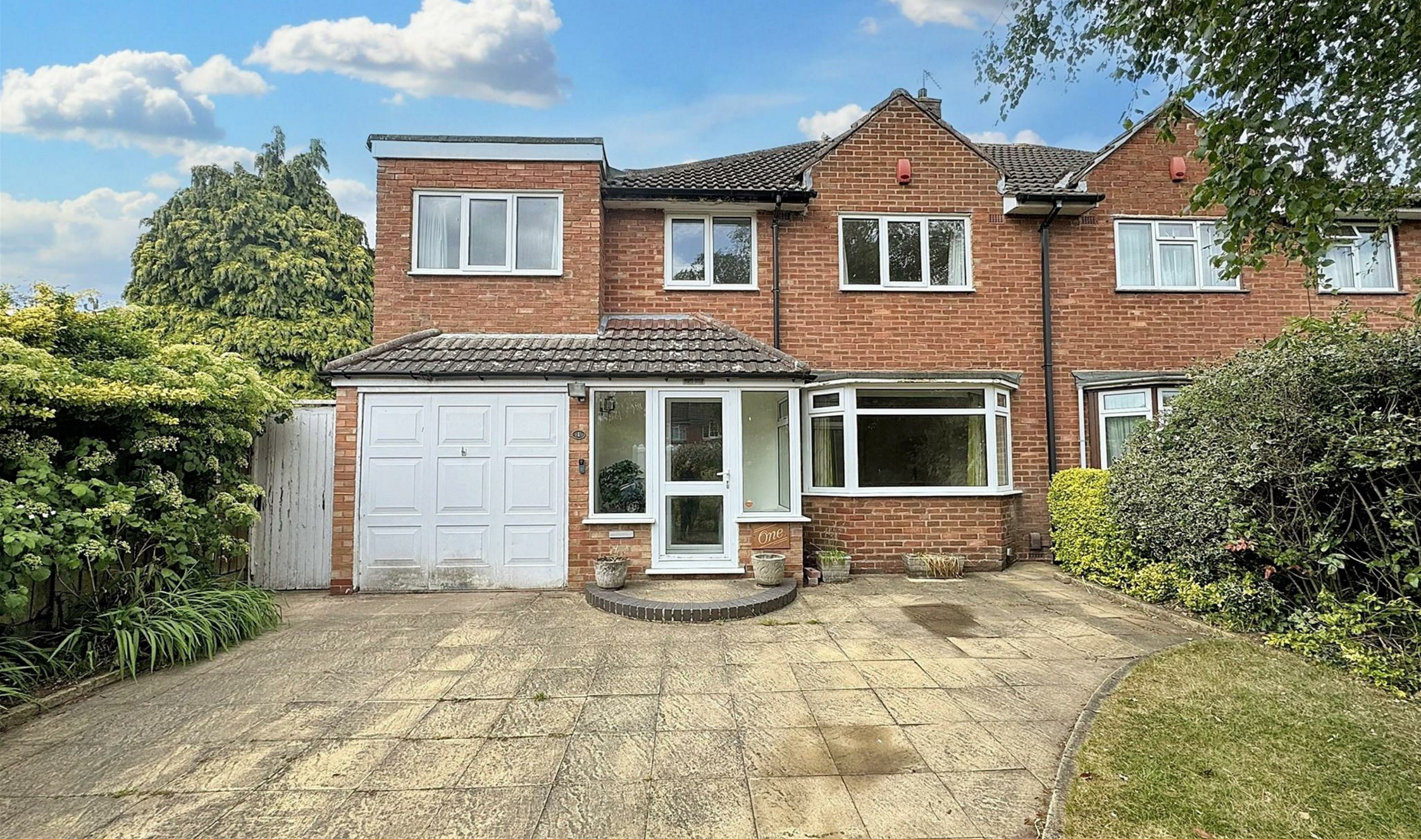
Rectory Park Close, Sutton Coldfield, B75 7BW