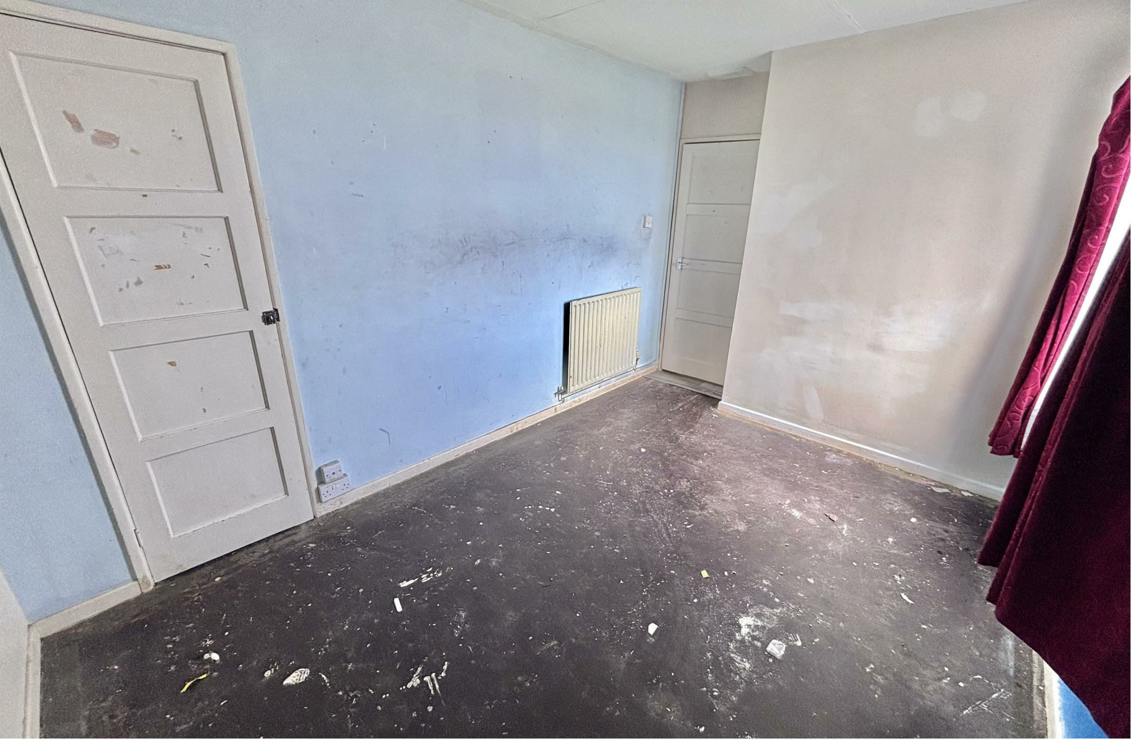
Penarwyn Road, St. Blazey, Par, PL24 2DT