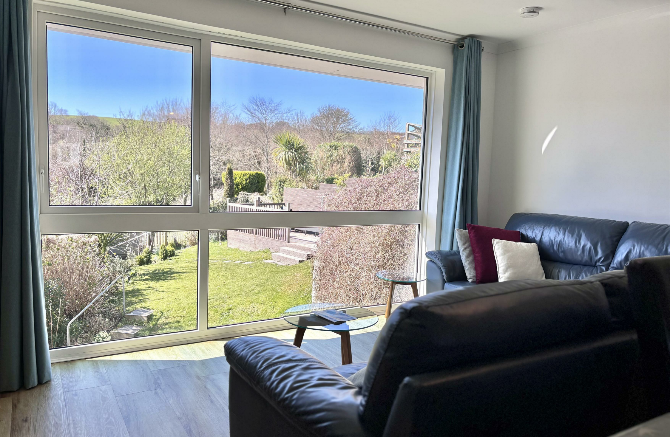
Woodgrove Park, Polgooth, St. Austell, PL26 7BN