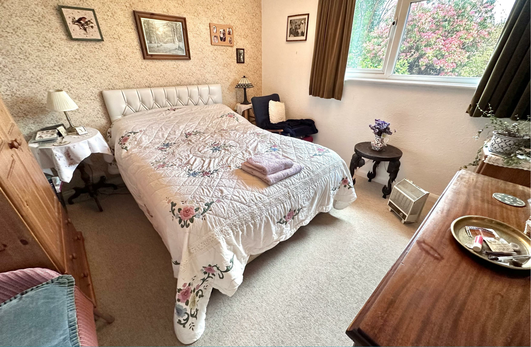
Scrations Lane, Lostwithiel, PL22 0DP