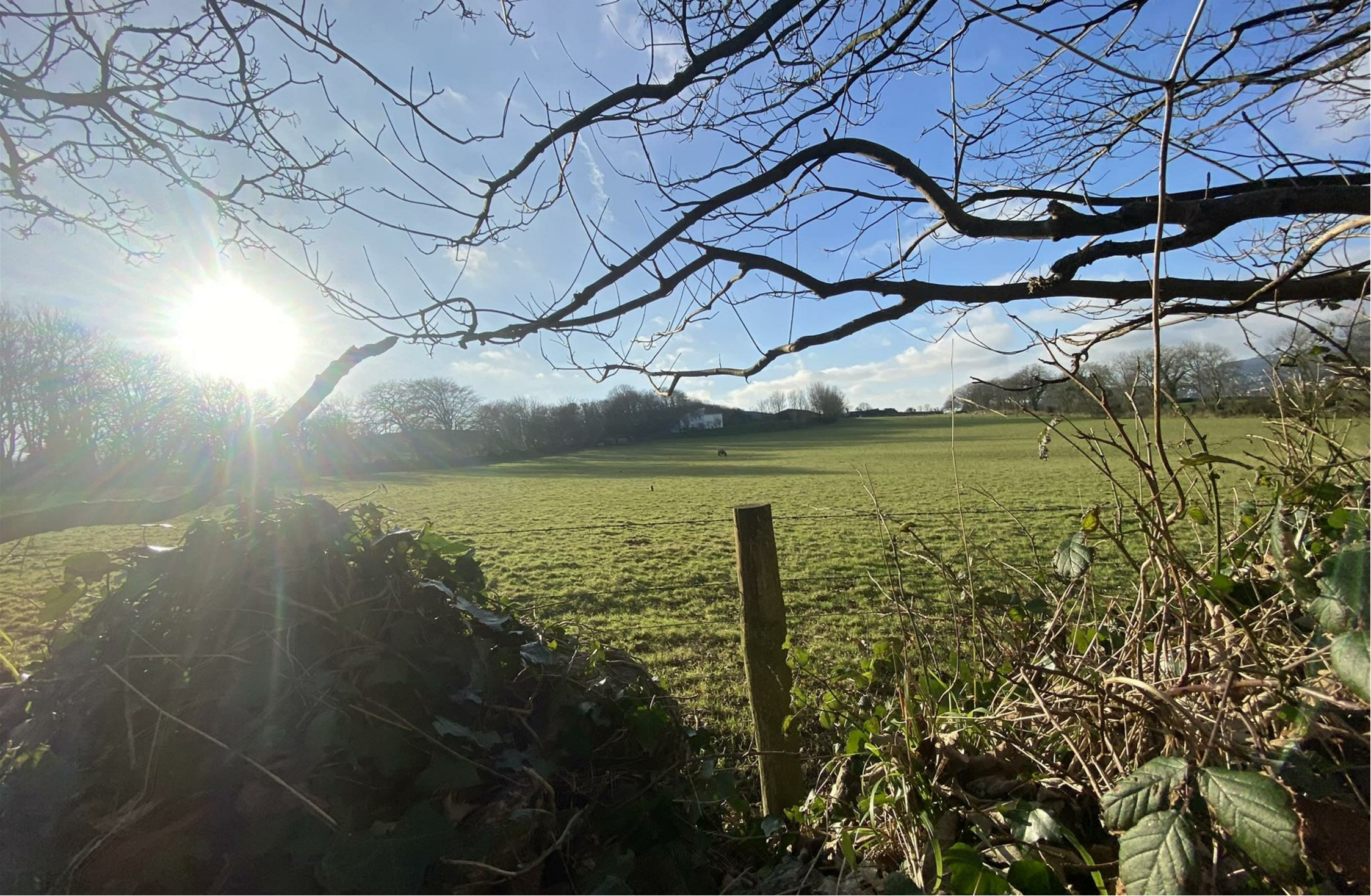
Quillet Close, St Austell, PL25 4GD