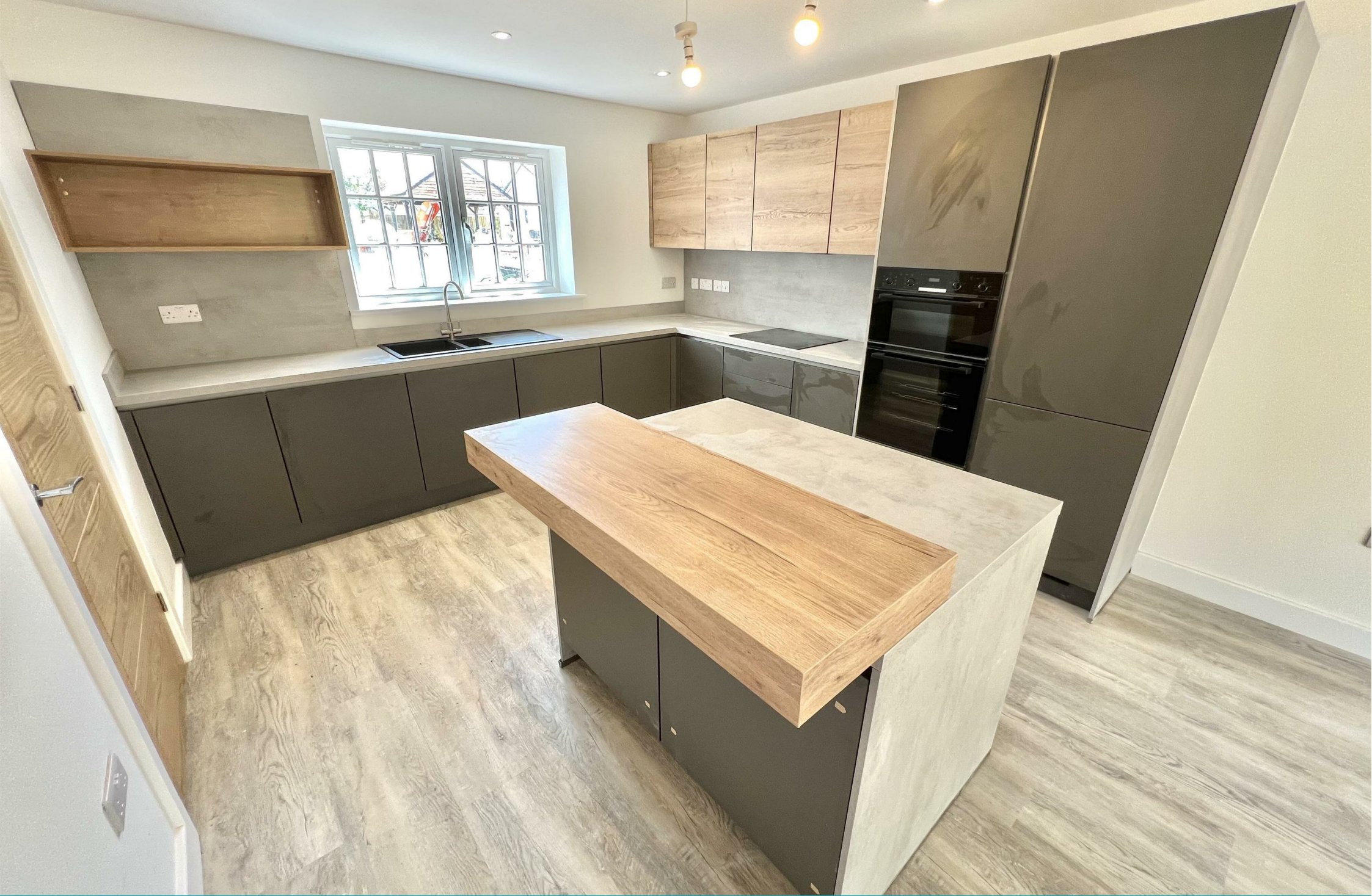
Treffry Gardens, Bugle, St. Austell, PL26 8QP