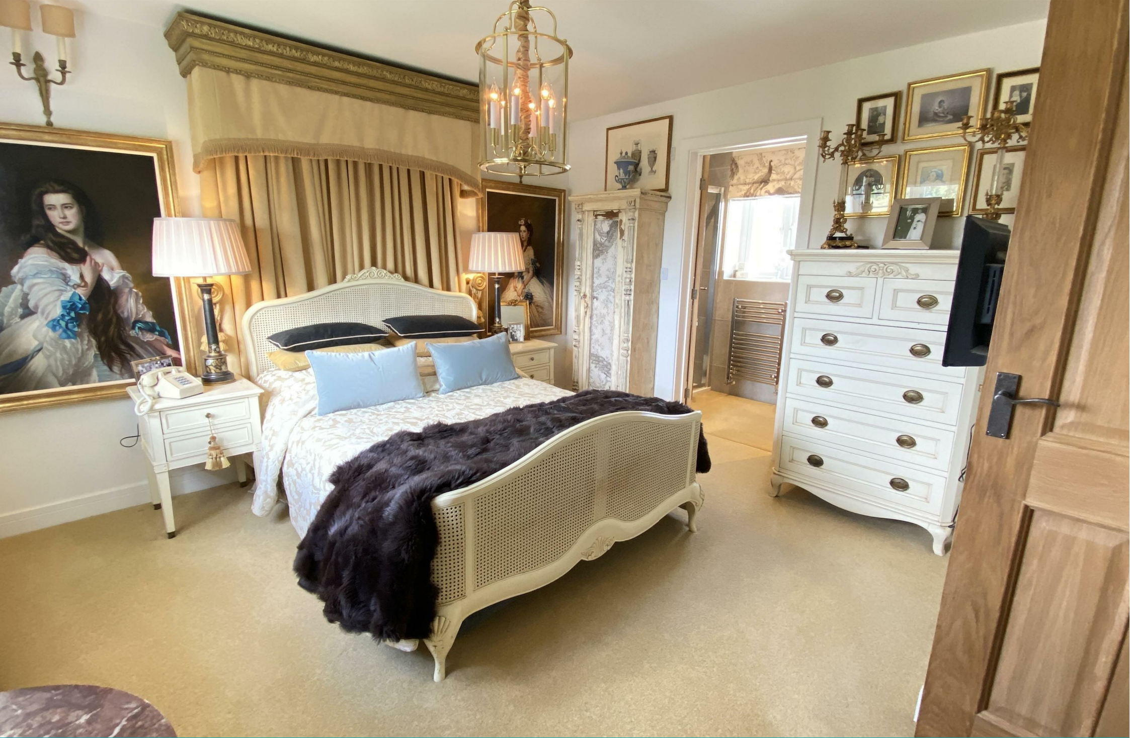
Darite, Nr Liskeard