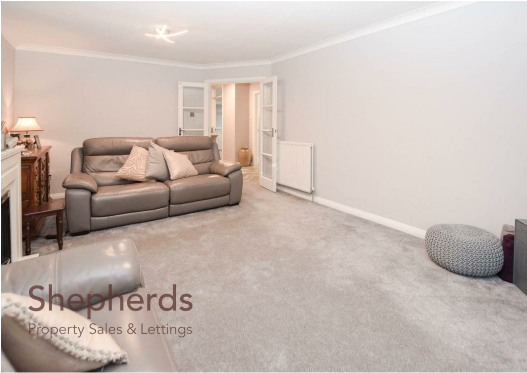
Shepherds Property Sales & Lettings