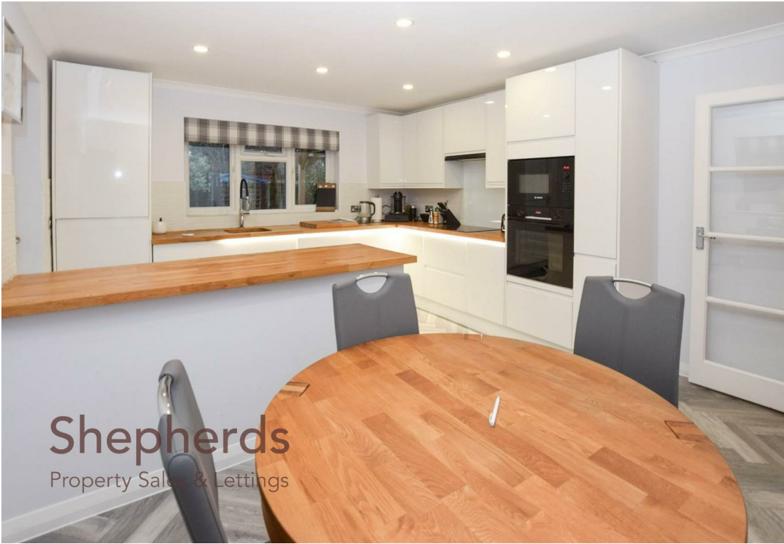
Shepherds Property Sales & Lettings