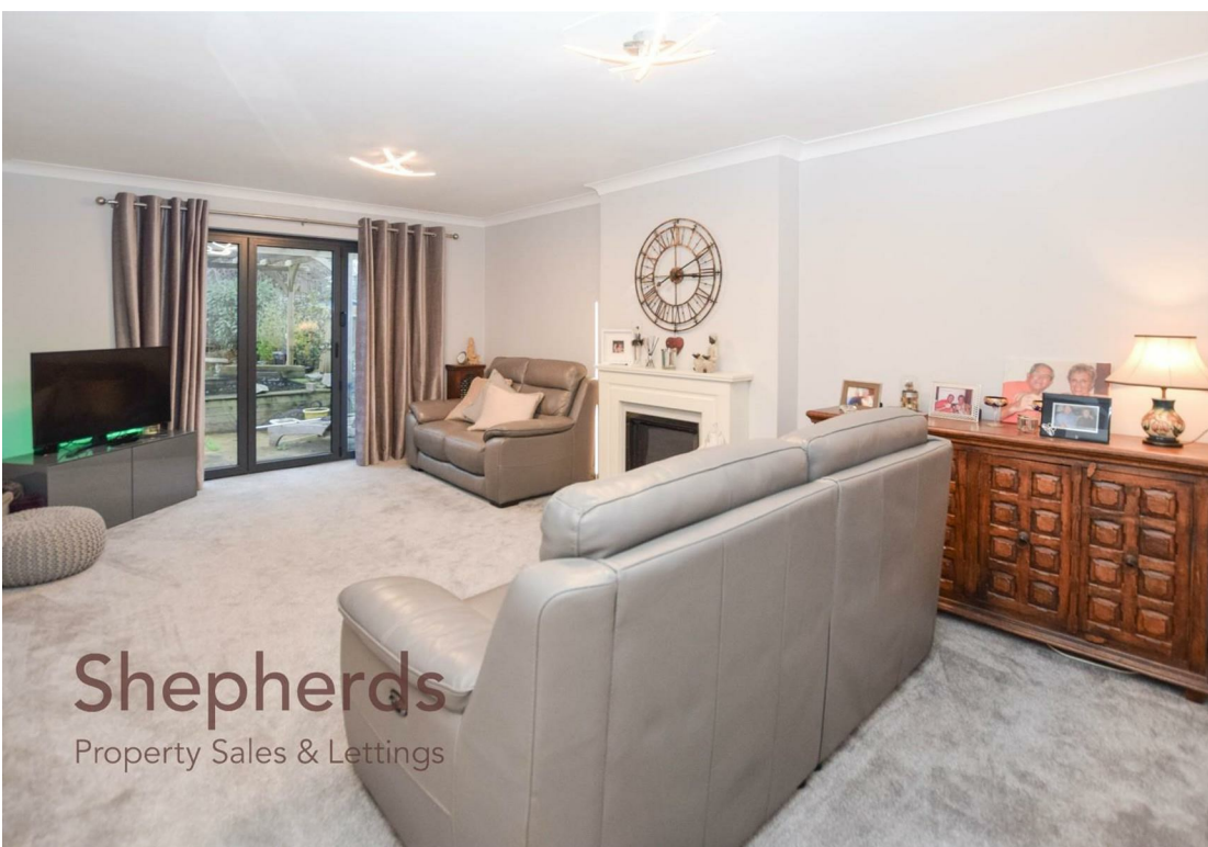
Shepherds Property Sales & Lettings