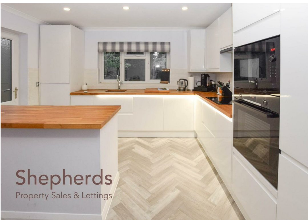
Shepherds Property Sales & Lettings