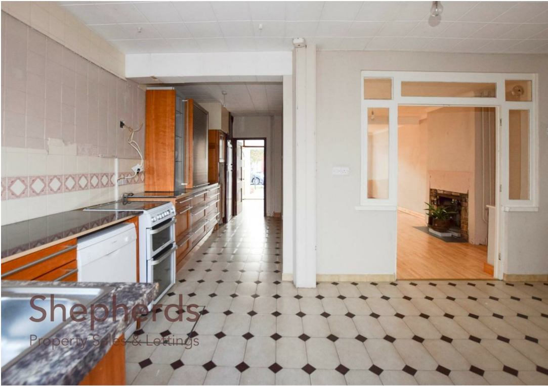
Shepherds Property Sales & Lettings