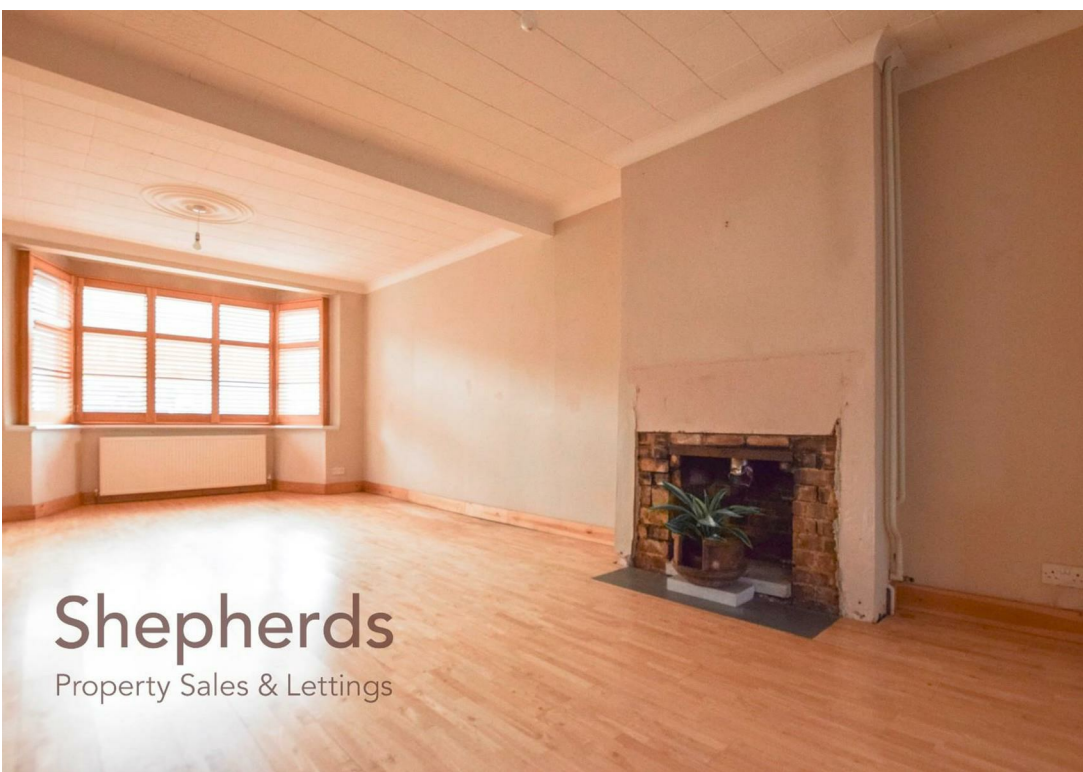
Shepherds Property Sales & Lettings