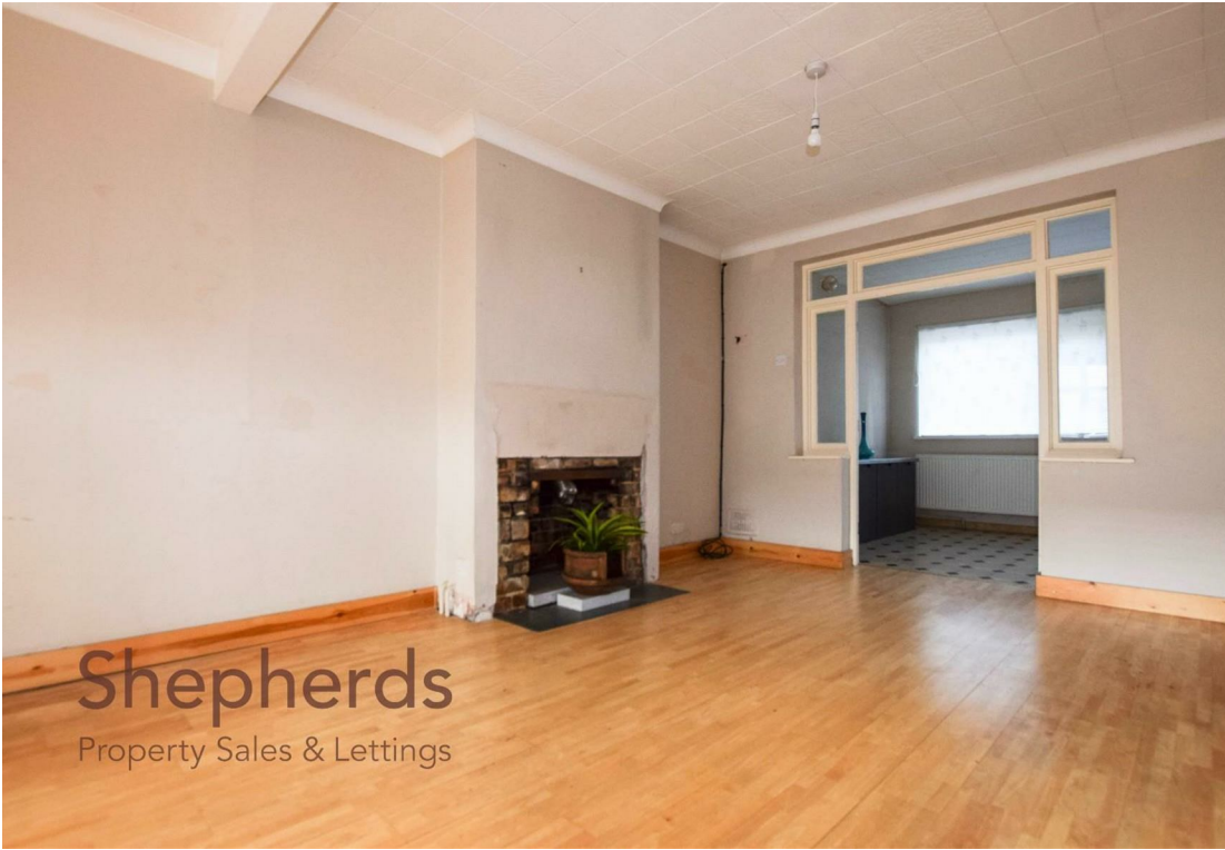
Shepherds Property Sales & Lettings