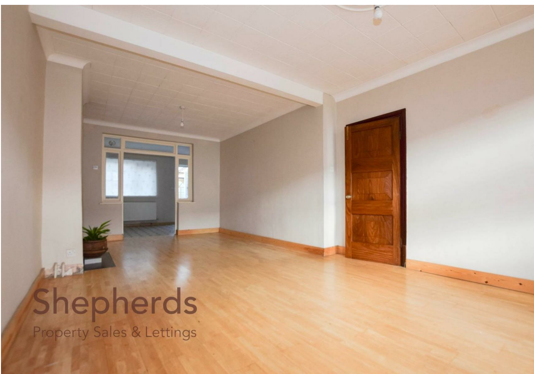
Shepherds Property Sales & Lettings