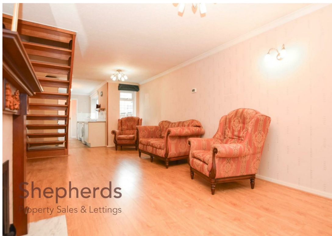
Shepherds Property Sales & Lettings