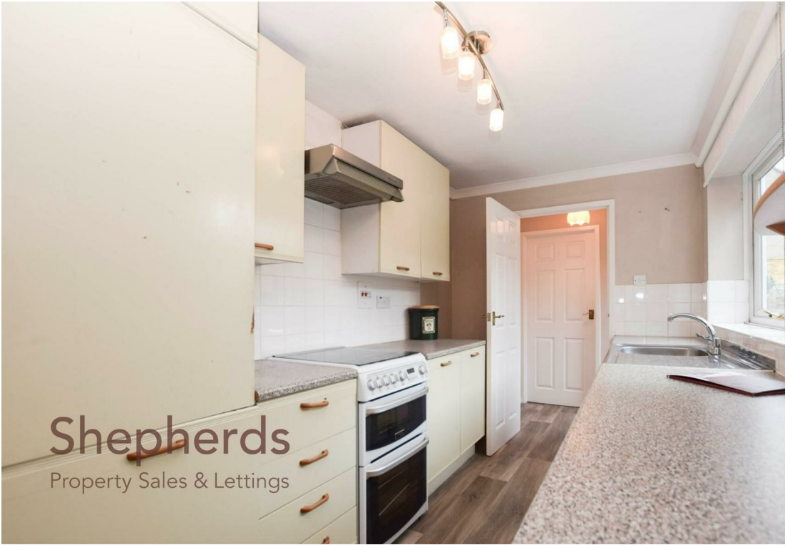
Shepherds Property Sales & Lettings