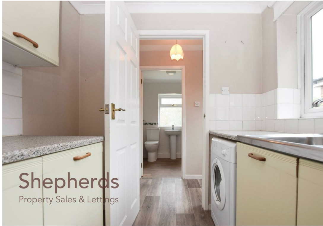
Shepherds Property Sales & Lettings