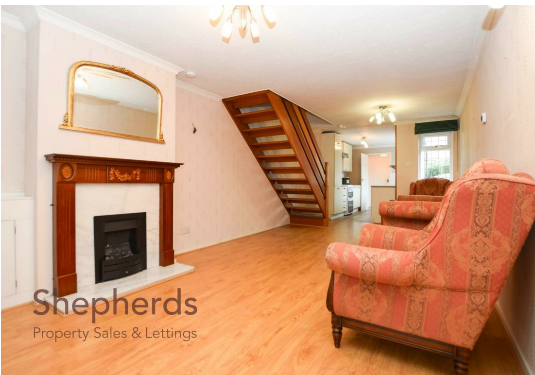
Shepherds Property Sales & Lettings