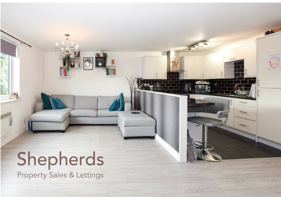
Shepherds Property Sales & Lettings