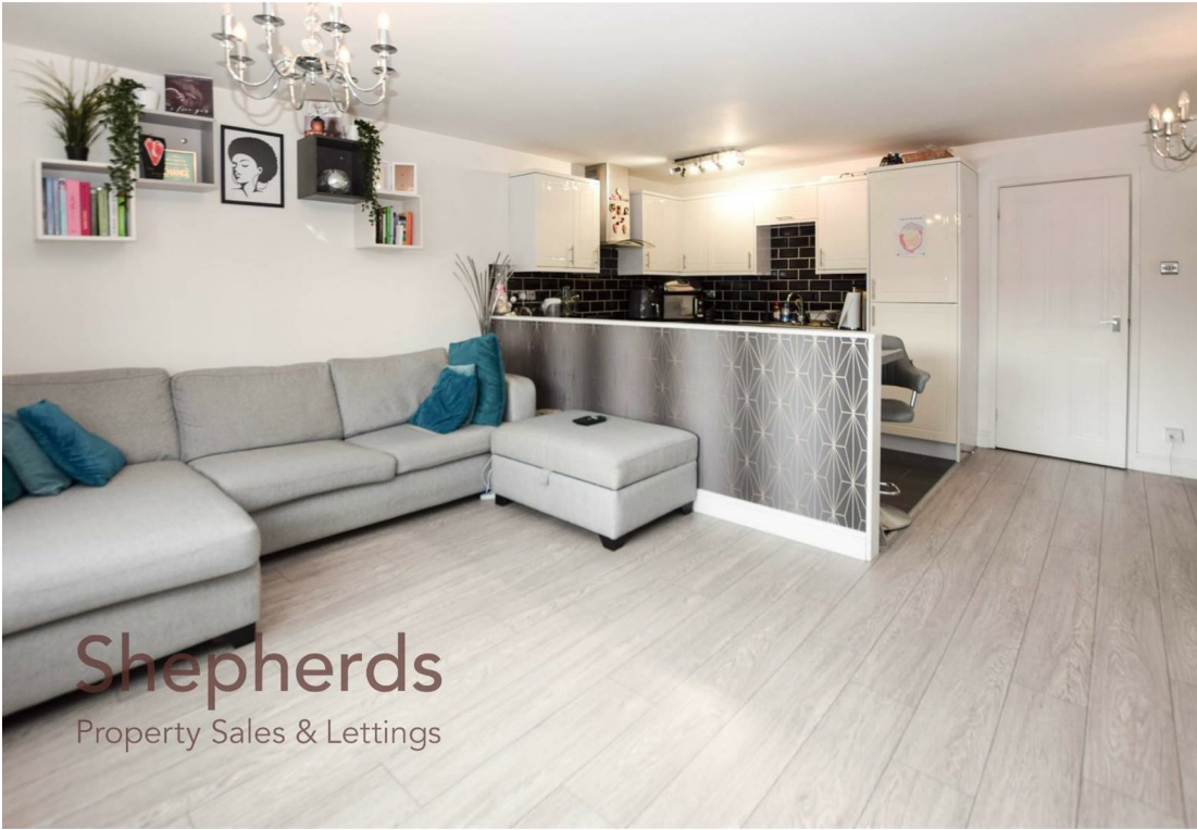
Shepherds Property Sales & Lettings