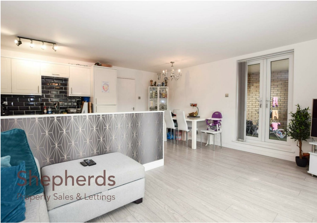
Shepherds Property Sales & Lettings