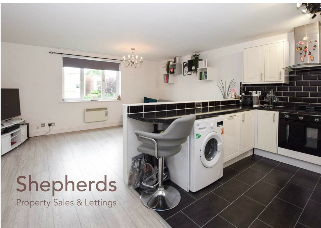
Shepherds Property Sales & Lettings