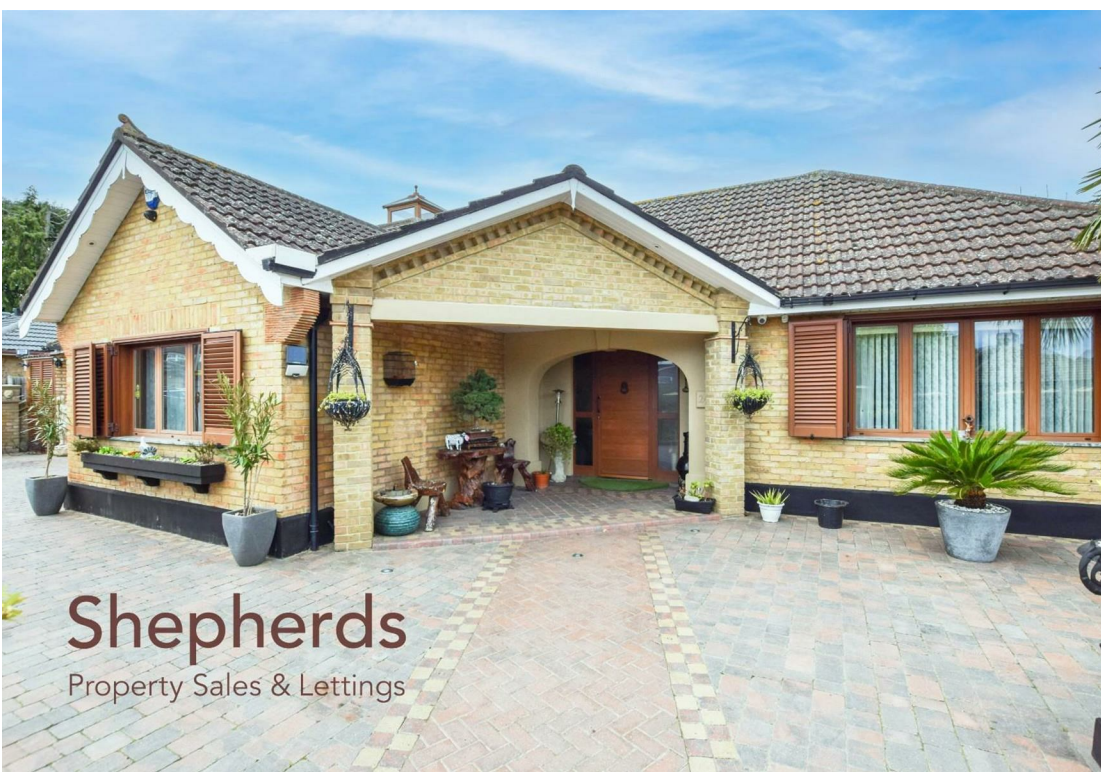
Shepherds Property Sales & Lettings