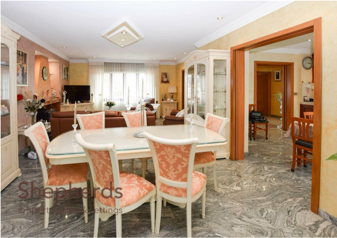
Shepherds Property Sales & Lettings