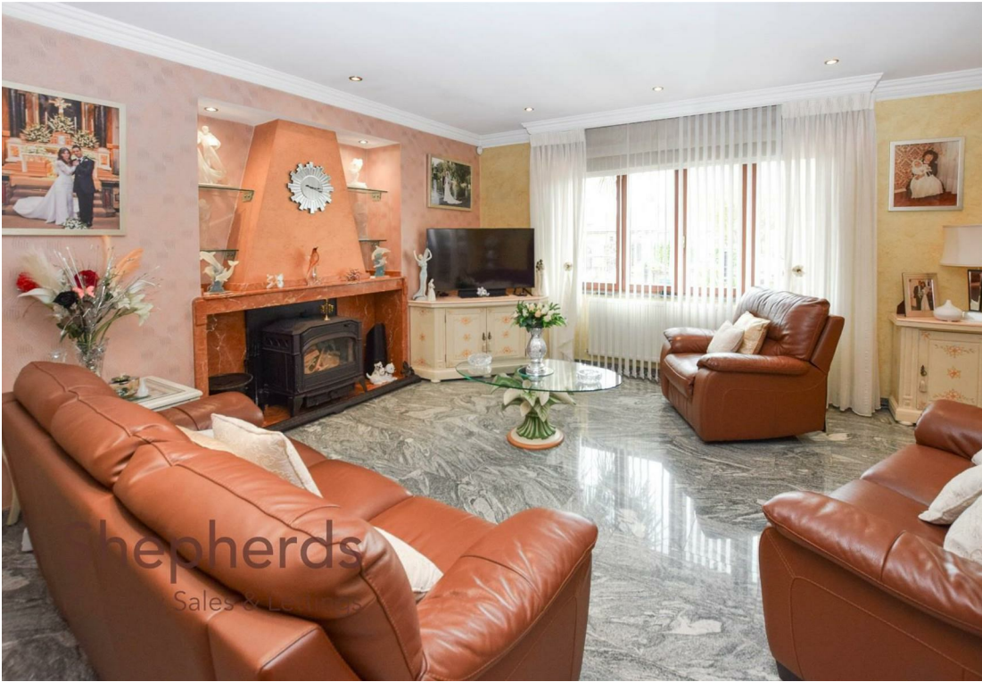
Shepherds Property Sales & Lettings