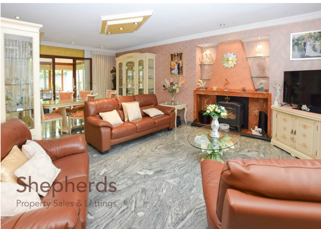
Shepherds Property Sales & Lettings