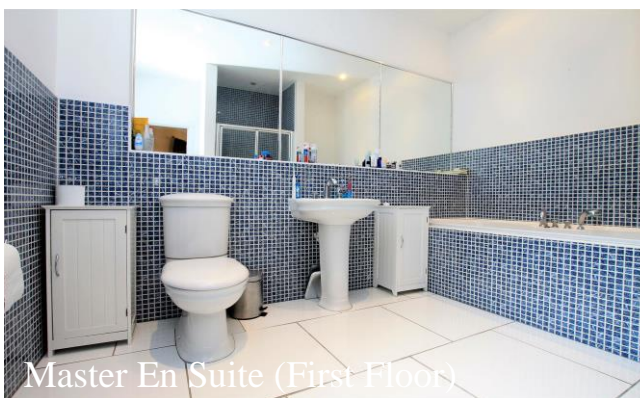
Master En Suite (First Floor)