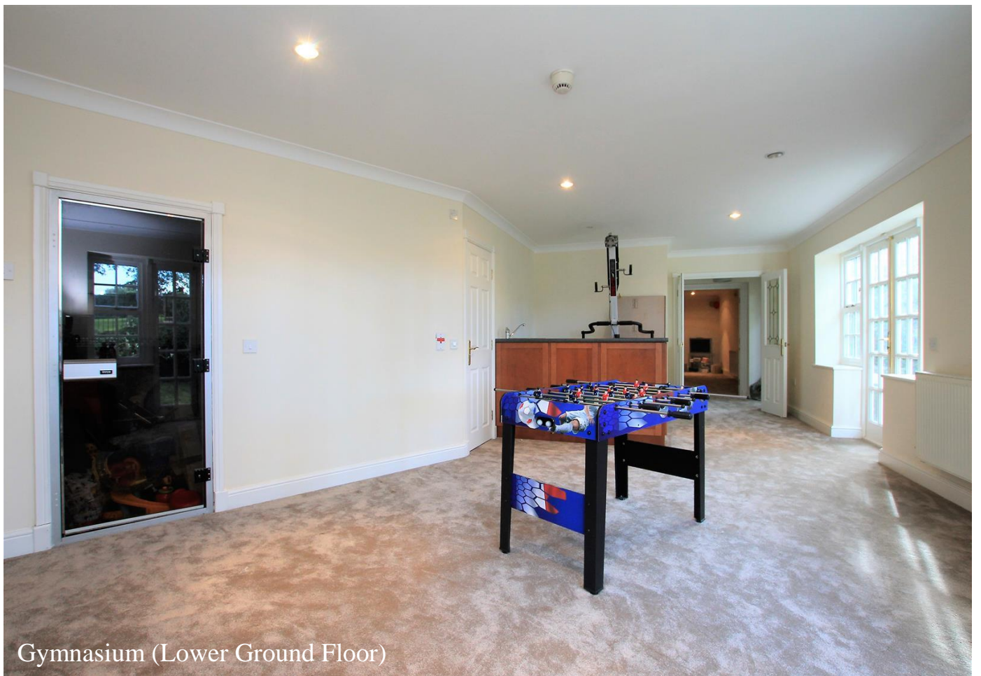
Gymnasium (Lower Ground Floor)