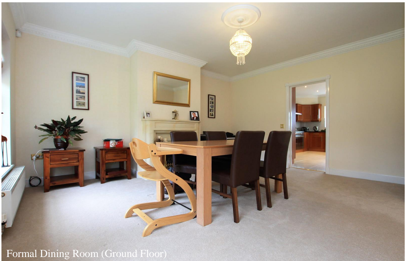
Formal Dining Room (Ground Floor)