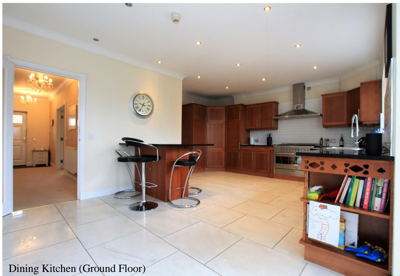
Dining Kitchen (Ground Floor)

Externally, there are good-sized garden areas to the front and rear elevations, and an integral double garage. Internal inspection is essential to appreciate all that this executive home has to offer.