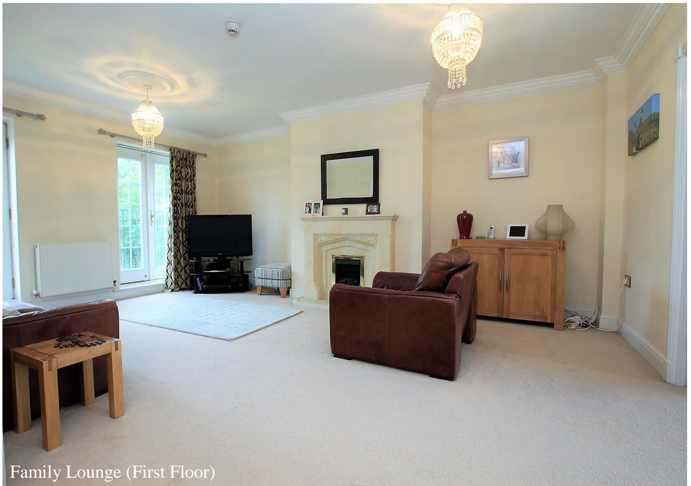
Family Lounge (First Floor)