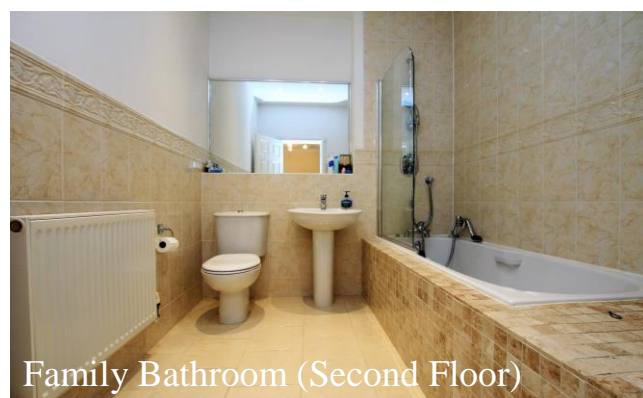
Family Bathroom (Second Floor)