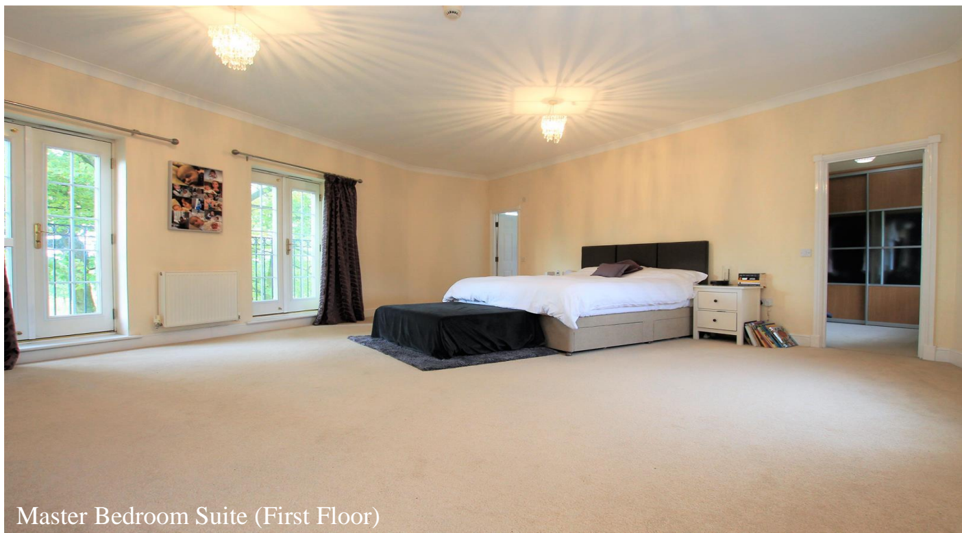
Master Bedroom Suite (First Floor)