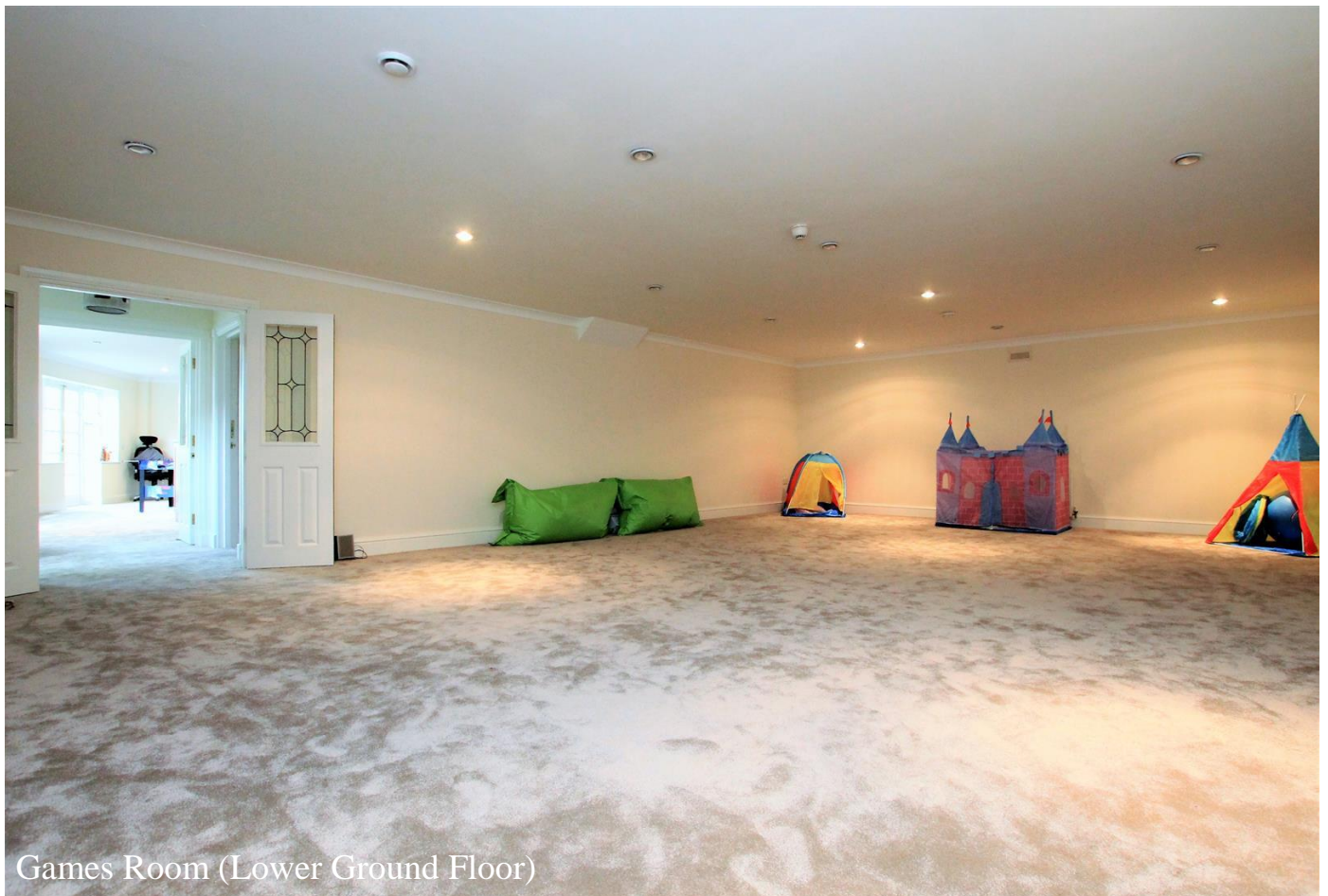
Games Room (Lower Ground Floor)