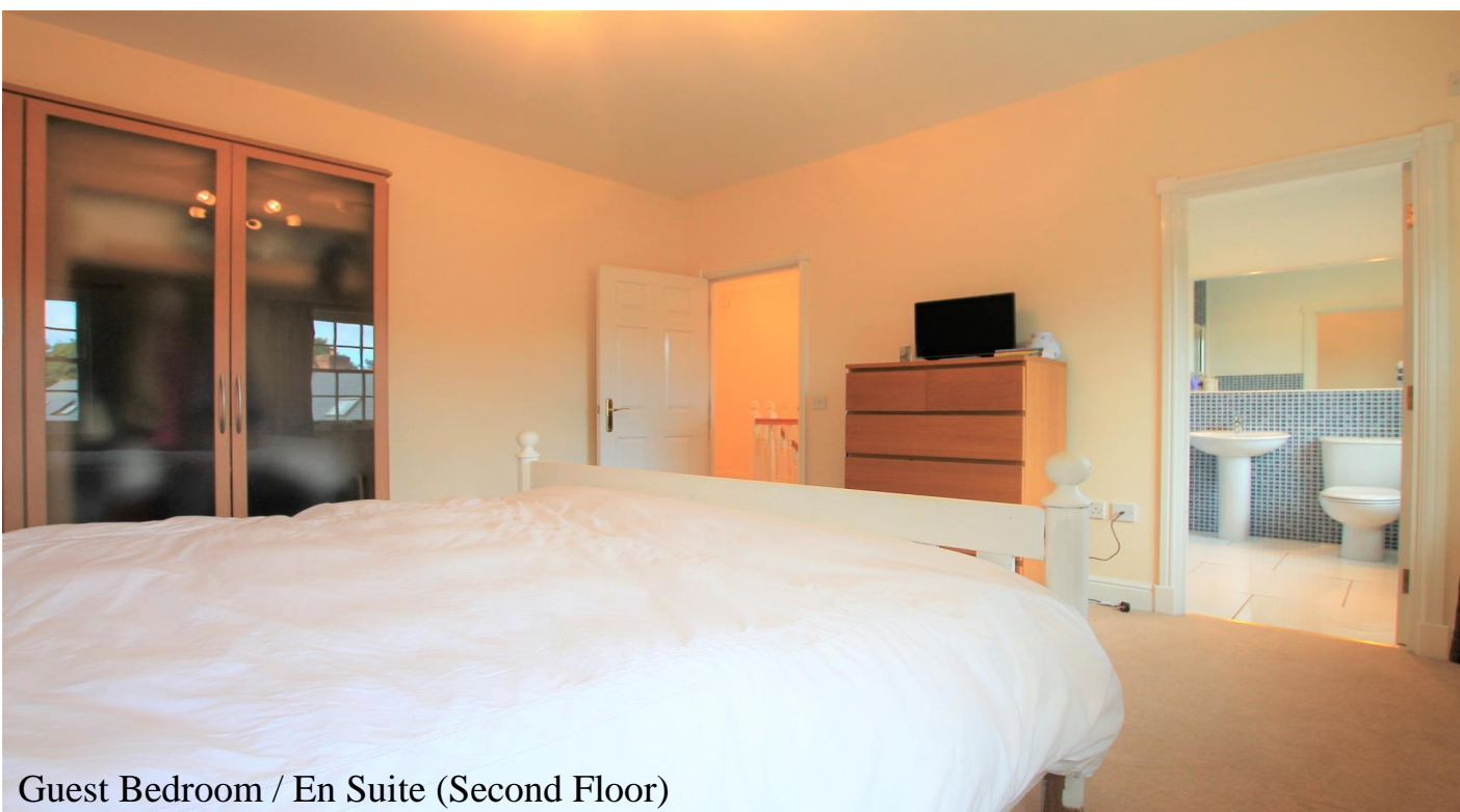
Guest Bedroom / En Suite (Second Floor)