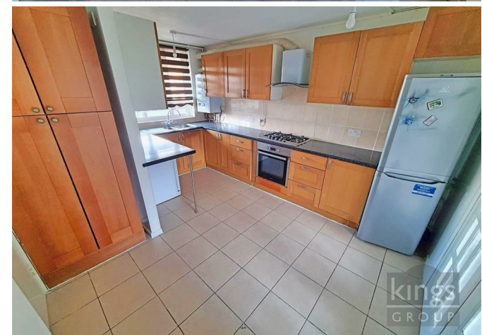
3 BED FLAT

Whilst every attempt has been made to ensure the accuracy of the floorplan contained here, measurements of doors, windows, rooms and any other items are approximate and no responsibility is taken for any error, omission or mis-statement. This plan is for illustrative purposes only and should be used as such by any prospective purchaser. The services, systems and appliances shown have not been tested and no guarantee as to their operability or efficiency can be given. Made with Metropix ©2022