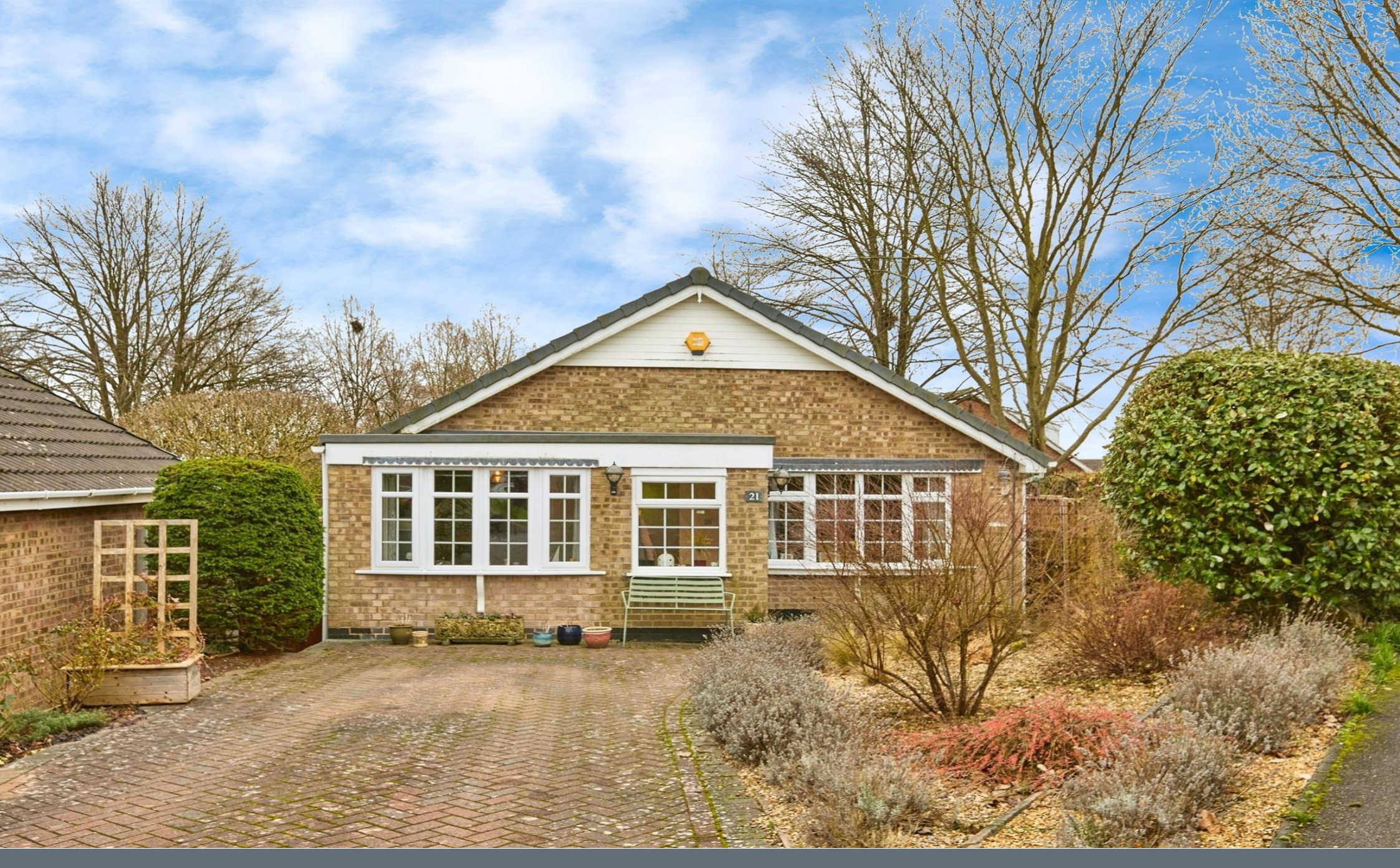
Medway Drive Allestree Derby