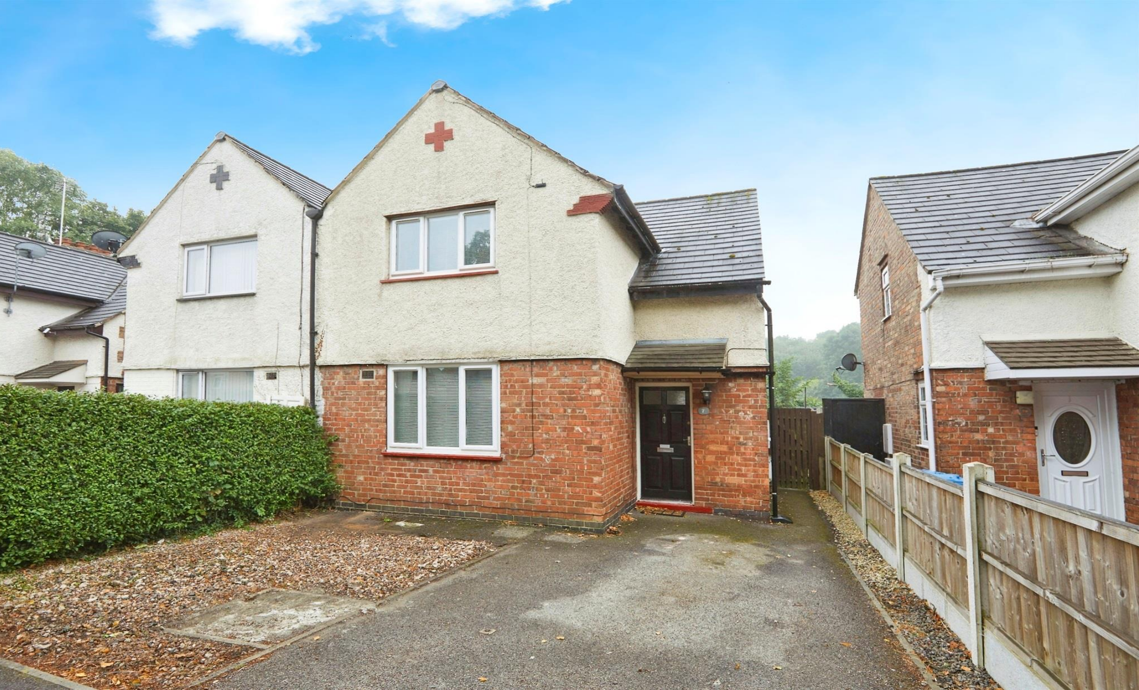
Cheviot Street Derby