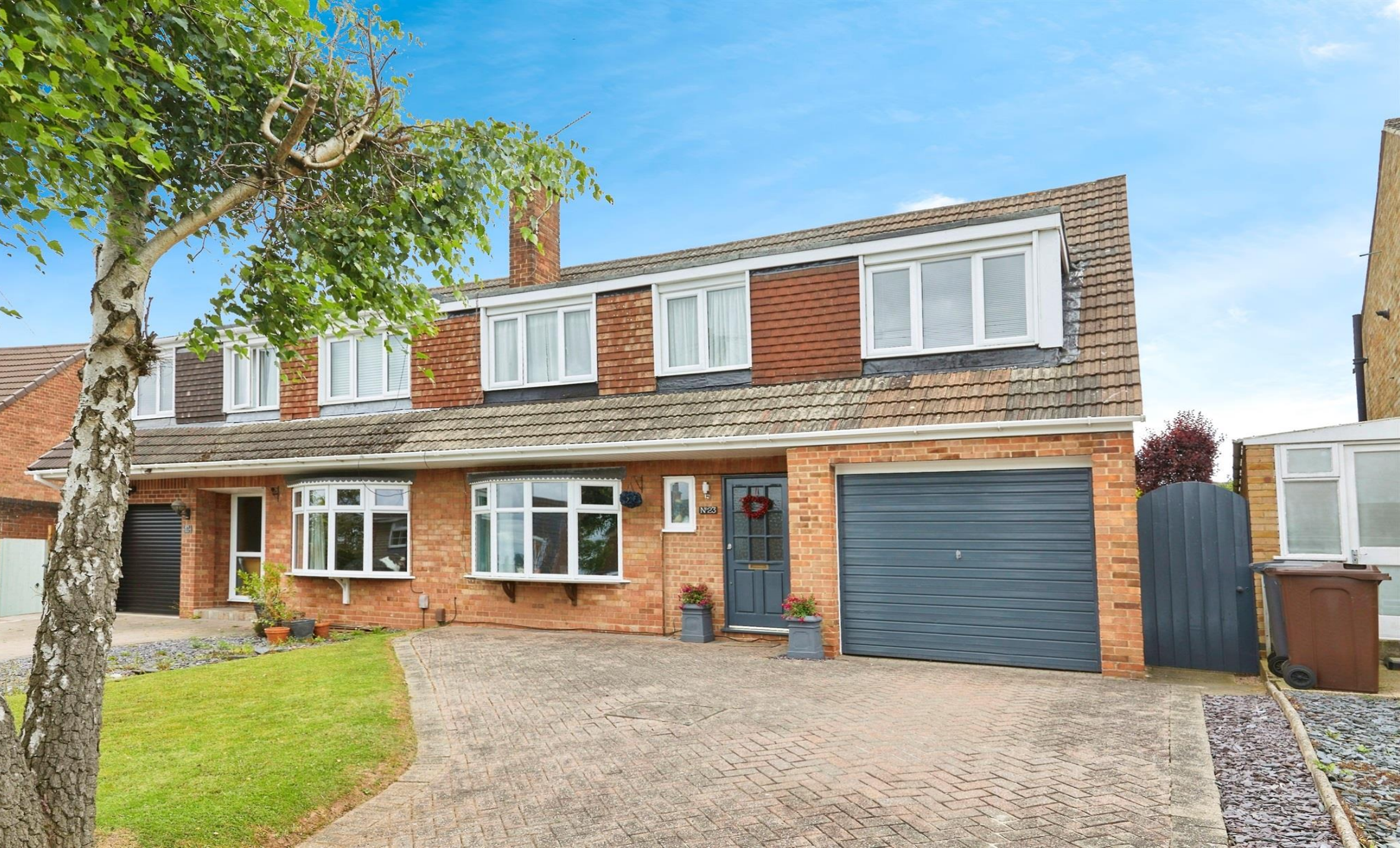
Windermere Crescent Allestree Derby