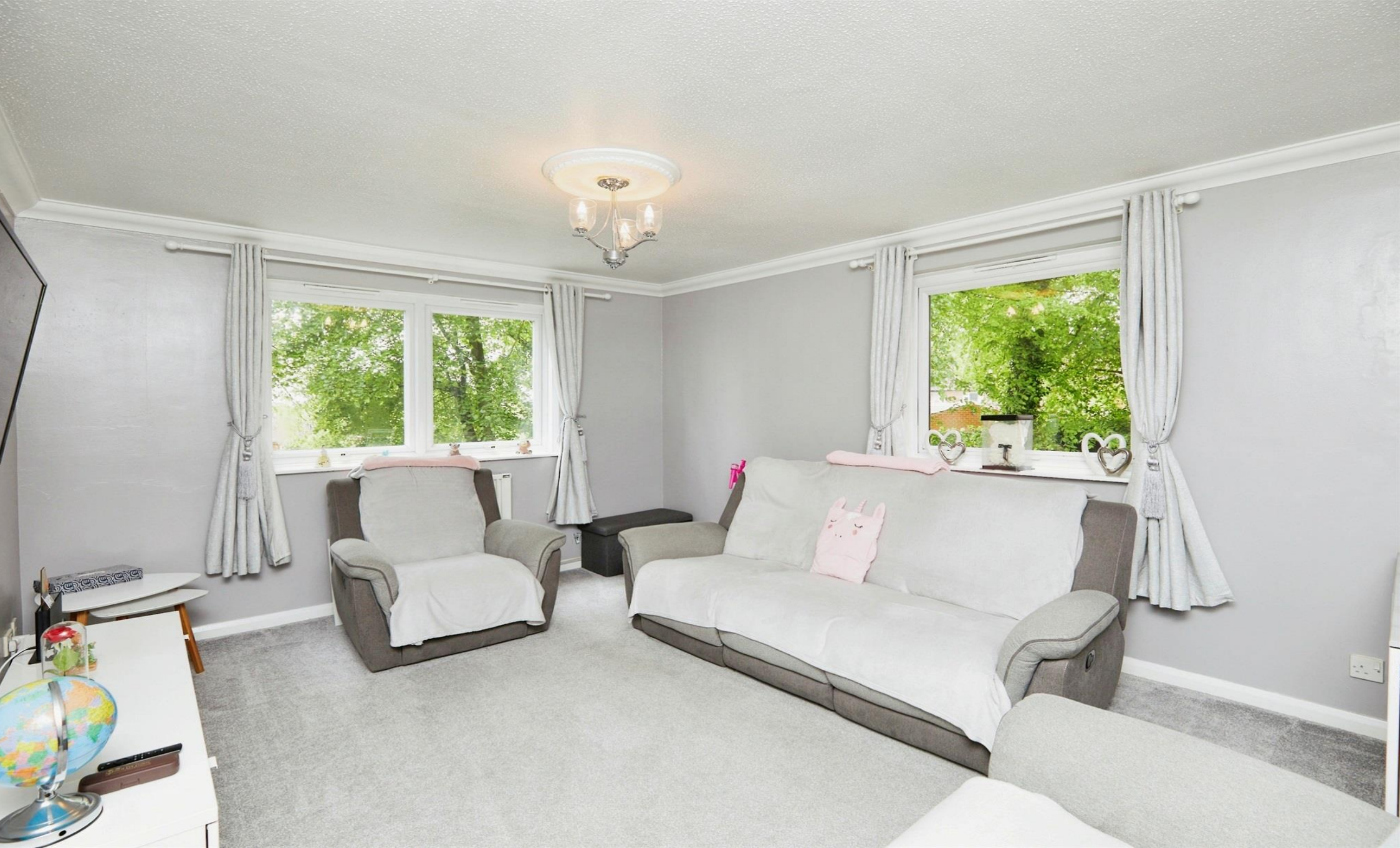
Hall Park Close Littleover Derby