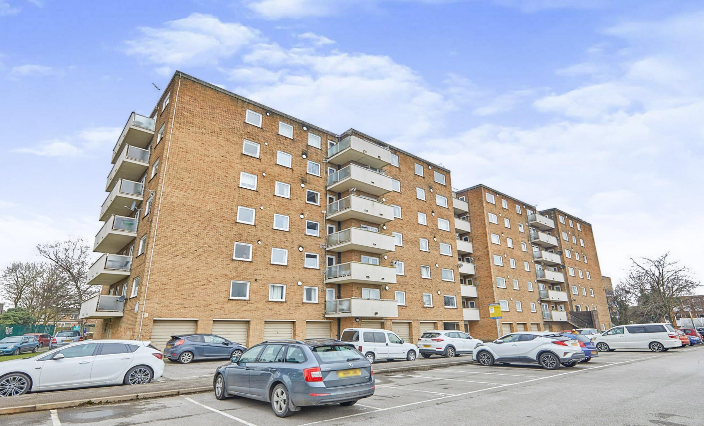
Kedleston Court Norbury Close Allestree Derby