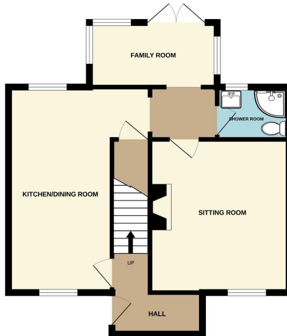
GROUND FLOOR 514 sq.ft. (47.8 sq.m.) approx.