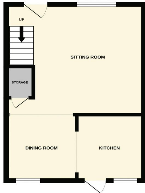
GROUND FLOOR 315 sq.ft. (29.3 sq.m.) approx.