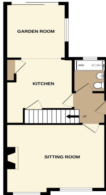
GROUND FLOOR 449 sq.ft. (41.7 sq.m.) approx.