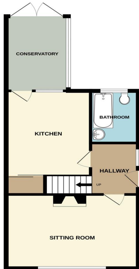
GROUND FLOOR 510 sq.ft. (47.4 sq.m.) approx.