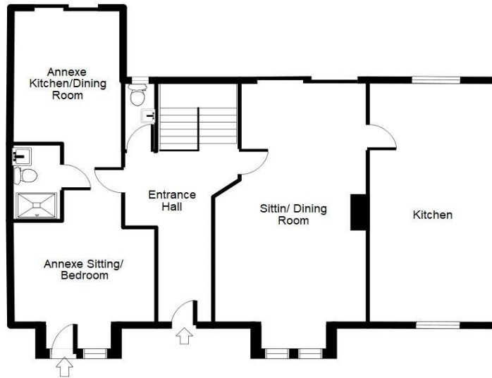
For identification only. (Not to scale)

MONEY LAUNDERING REGULATIONS 2003: Purchasers will be asked to produce identification and proof of financial status when an offer is received. We would ask for your co-operation in order that there will be no delay in agreeing the sale.