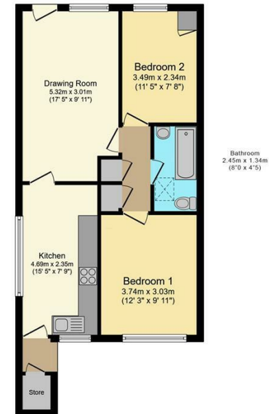
Floor Plan Floor area 57.2 sq.m. (615 sq.ft.)

Total floor area: 57.2 sq.m. (615 sq.ft.)