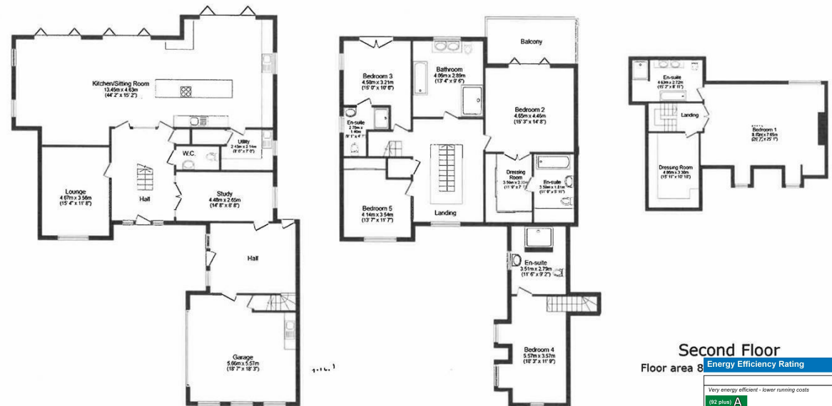
Ground Floor Floor area 194.8 sq.m. (2,096 sq.ft.)

Total Floor Area: 419.2 sq.m (4512 sq.ft)