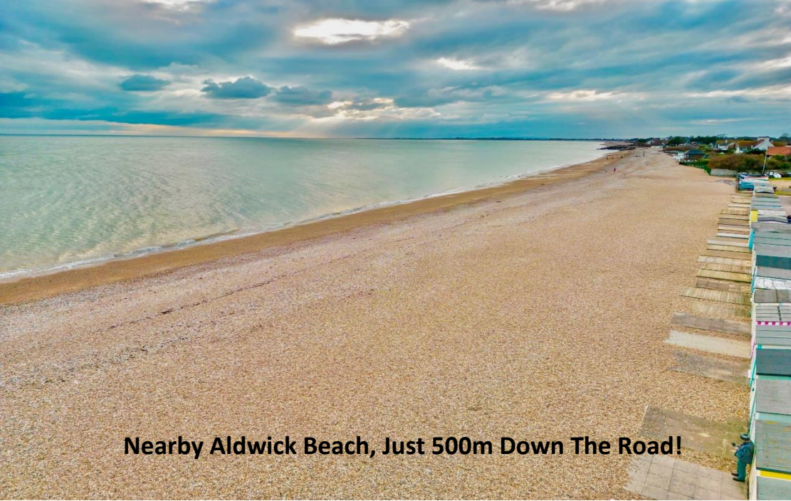
Nearby Aldwick Beach, Just 500m Down The Road!