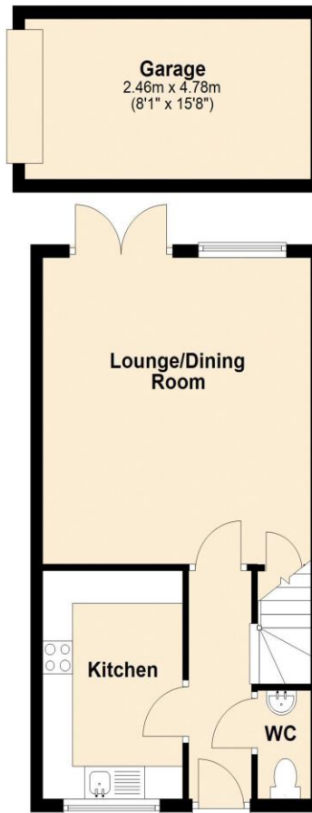
Ground Floor Approx. 48.9 sq. metres (526.8 sq. feet)