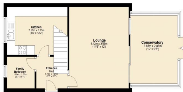
First Floor Approx. 32.8 sq. metres (353.5 sq. feet)