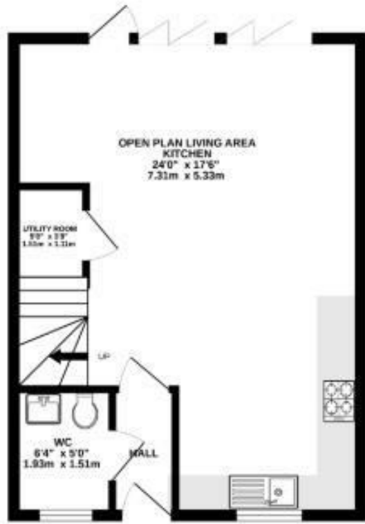
GROUND FLOOR 419 sq.ft. (38.9 sq.m.) approx.