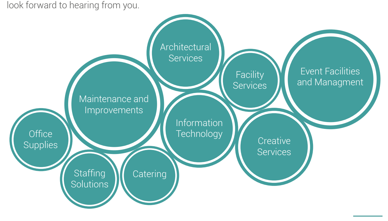
CDC250116 | Tenant Handbook | Issue <<issue-date>>

OVER 30 YEARS EXPERIENCE WORKING WITH PRIVATE AND PUBLIC SECTOR ORGANISATIONS