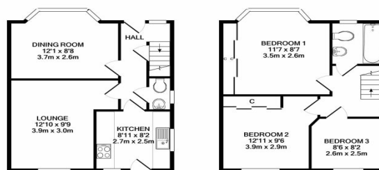
GROUND FLOOR APPROX. FLOOR AREA 432 SQ.FT. (40.1 SQ.M.)