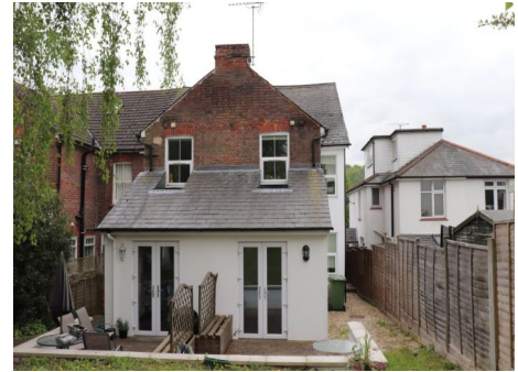
Pinions Road, High Wycombe, HP13 7AS