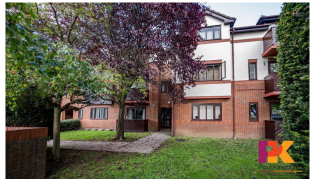
Litton Court, London Road, Loudwater, HP10 9RZ Approx. Total Area: 49.2 m 2 ... 530 ft 2