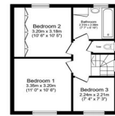
First Floor Floor area 38.1 m 2 (411 sq.ft.)