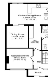
Ground Floor Floor area 58.9 m 2 (634 sq.ft.)