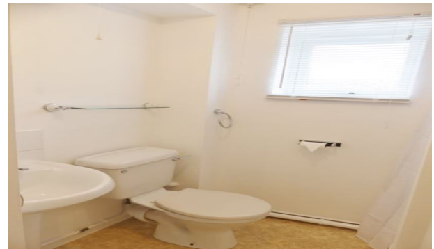
100 Desborough Park Road, High Wycombe, HP12 3EF Total Area: 32.2 m 2 ... 347 ft 2