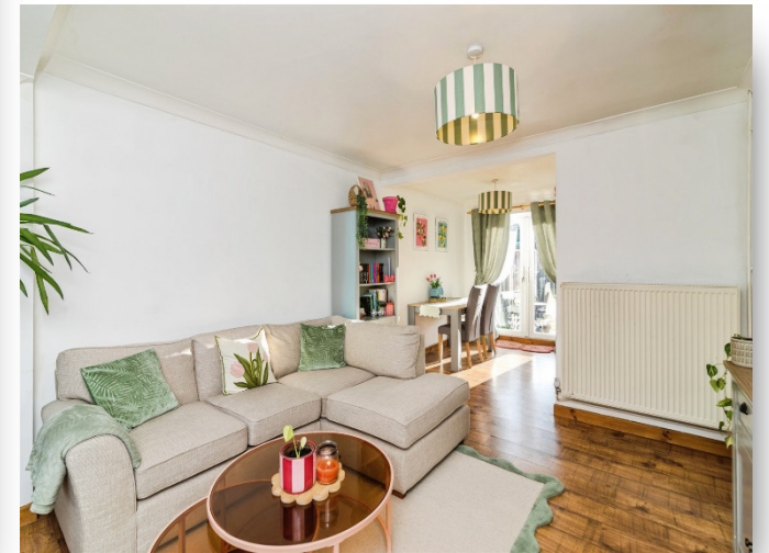
Buttercup Close, Carlton Colville Lowestoft NR33 8NW