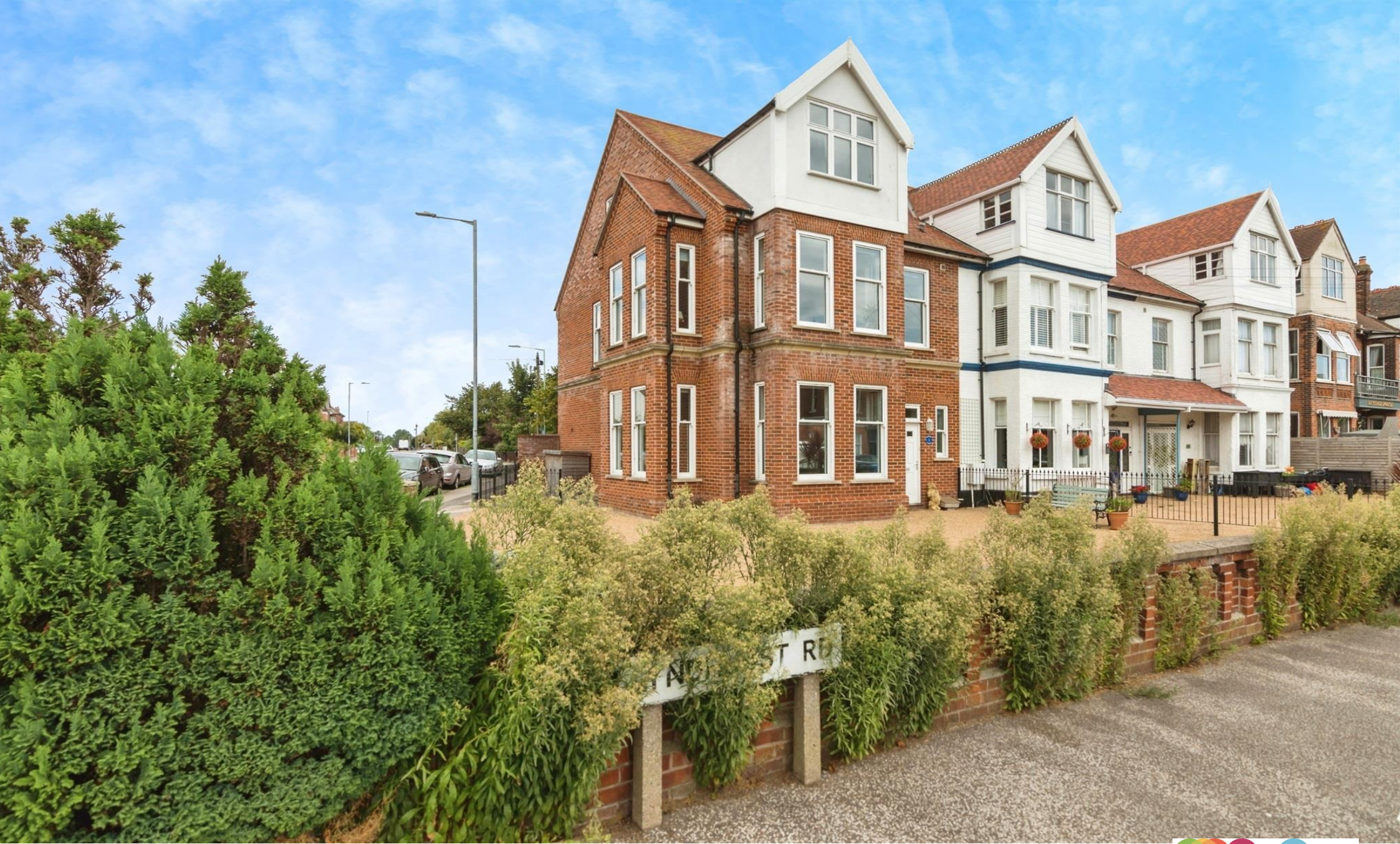
Sunrise Terrace, Lowestoft NR32 4FA