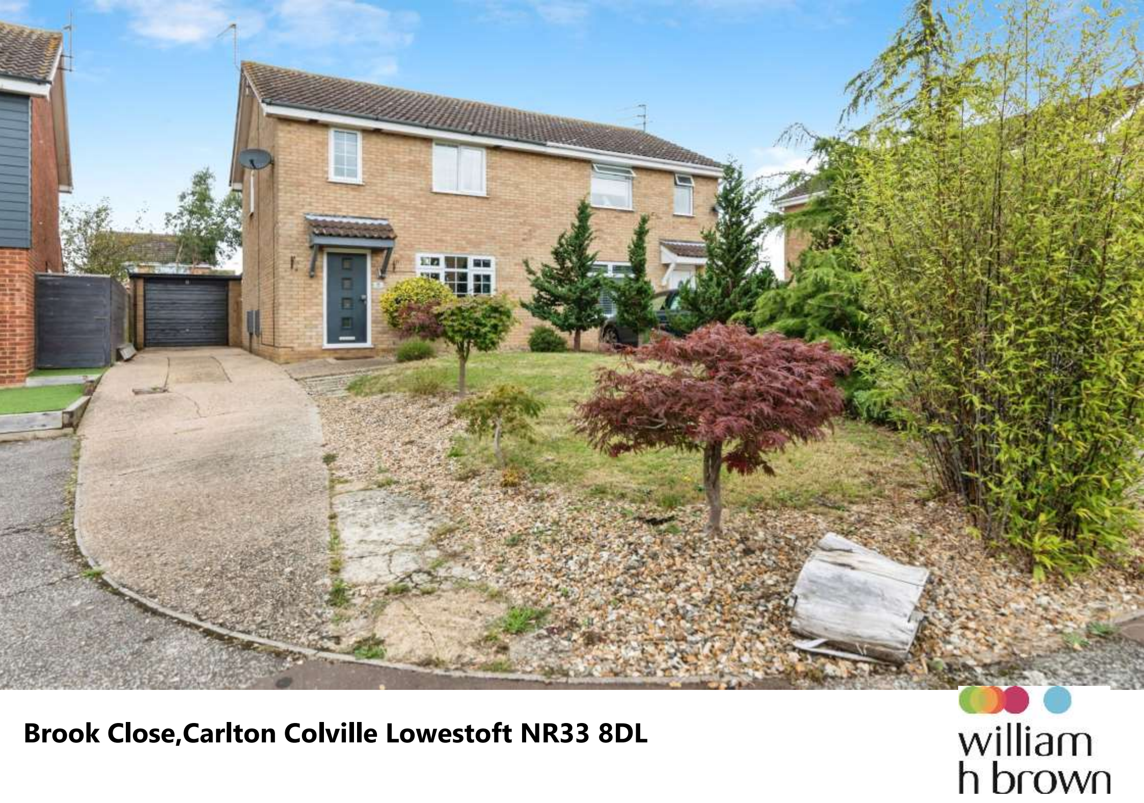
Brook Close, Carlton Colville Lowestoft NR33 8DL