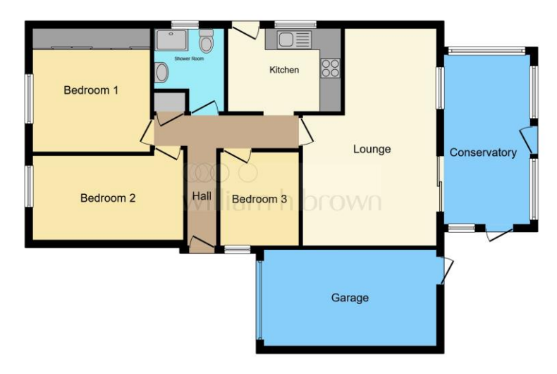
This floor plan is for illustrative purposes only. It is not drawn to scale. Any measurements, floor areas (including any total floor area), openings and crientation are approximate. No details are guaranteed, they cannot be relied upon for any purpose and they do not form part of any agreement. No liability is taken for any error, omission or misstatement. A party must rely upon its own inspection(s). Powered by www.foo.ealeant.com