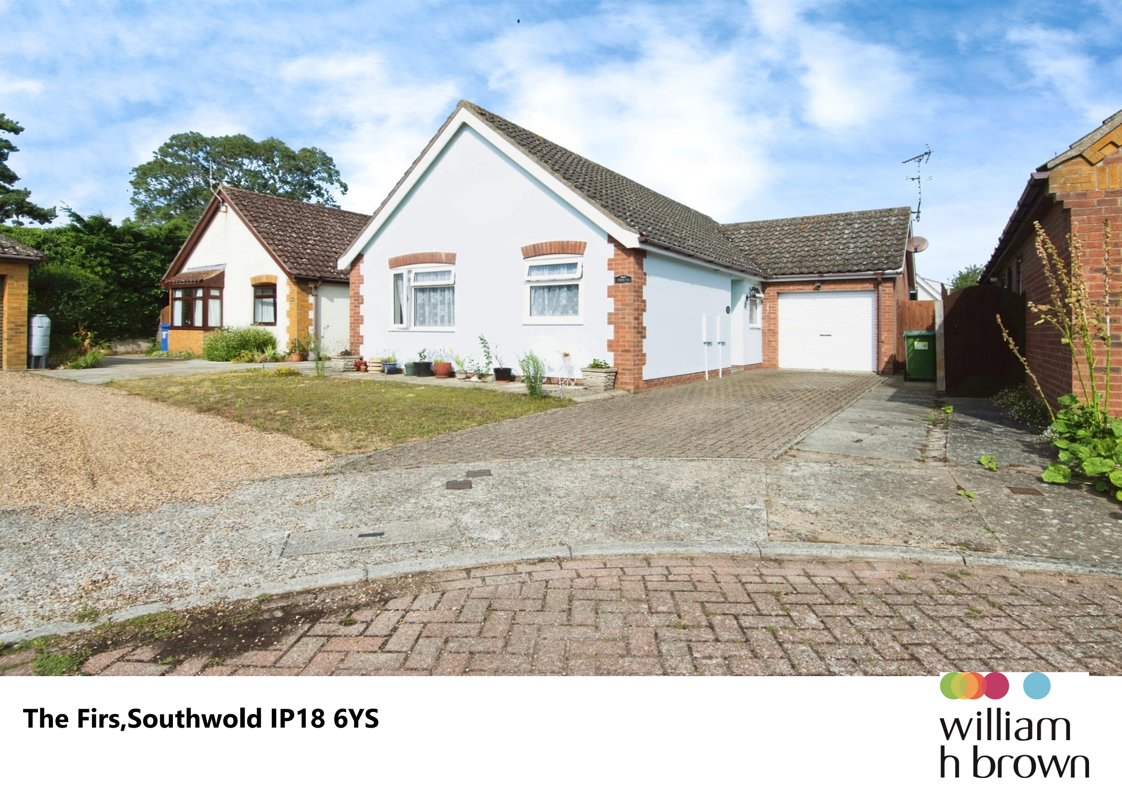
The Firs, Southwold IP18 6YS