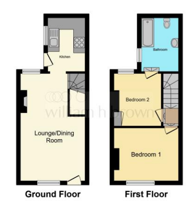
for any purpose and they do not form part of any agreement. No liability is taken for any error, omission or mis