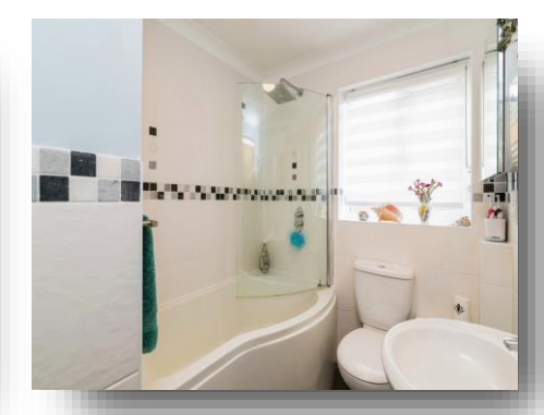
view this property online williamhbrown.co.uk/Property/LOW108308