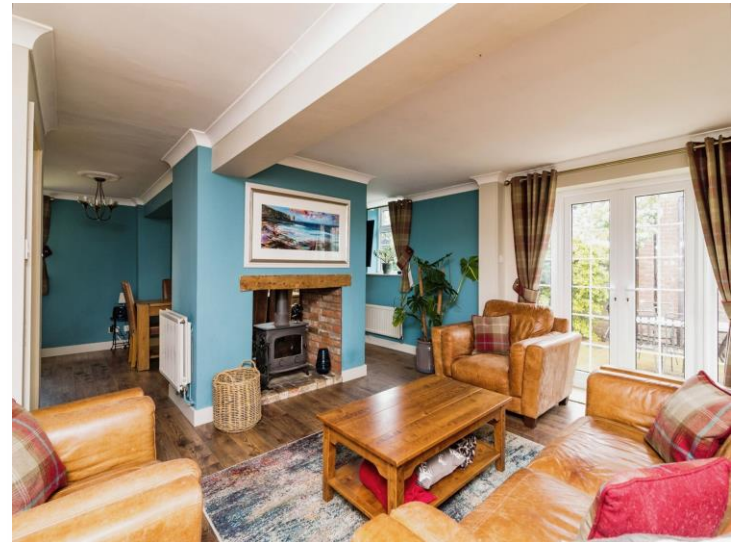
5 Saw Mills, Flixton Hall Estate Bungay NR35 1NP