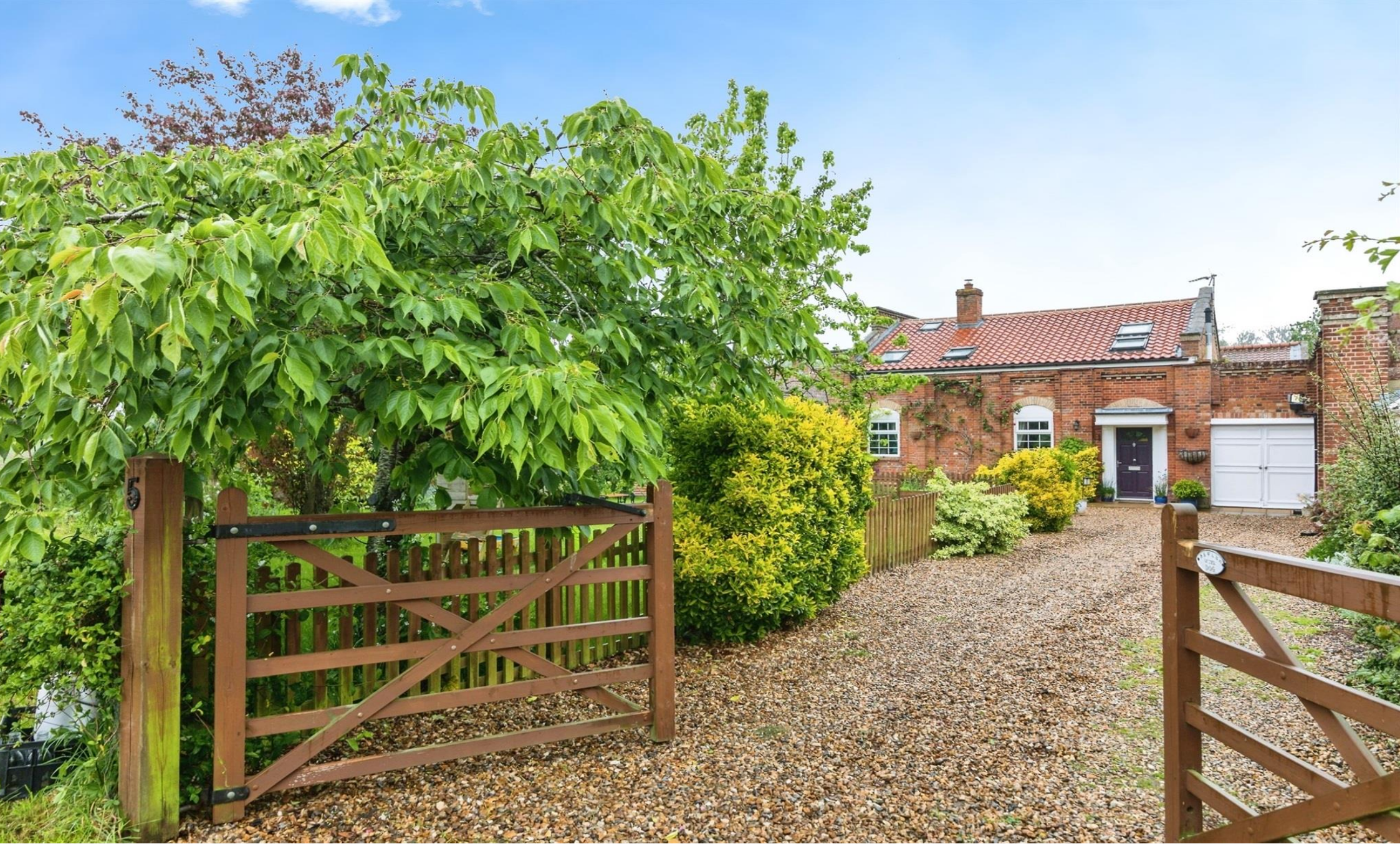
5 Saw Mills, Flixton Hall Estate Bungay NR35 1NP