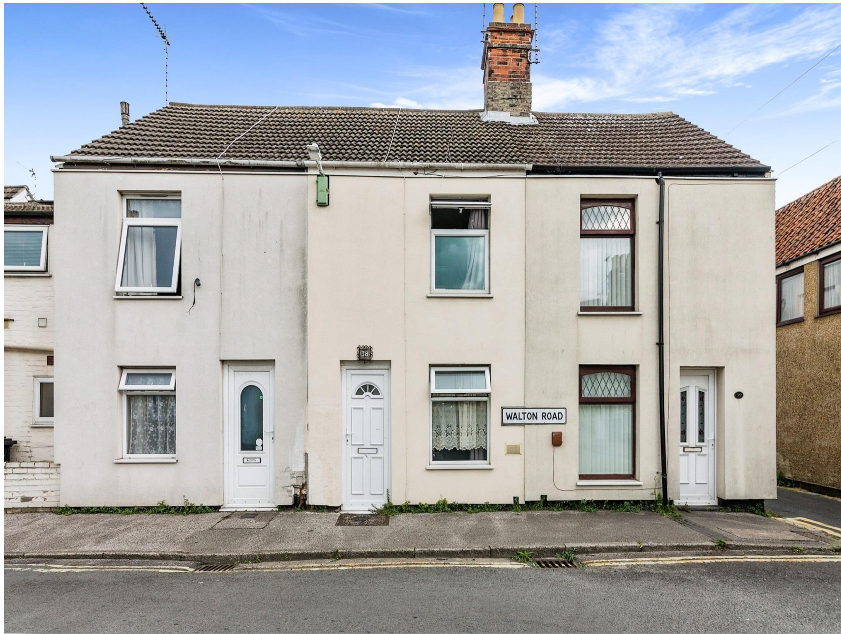
Walton Road, Lowestoft NR32 2DX