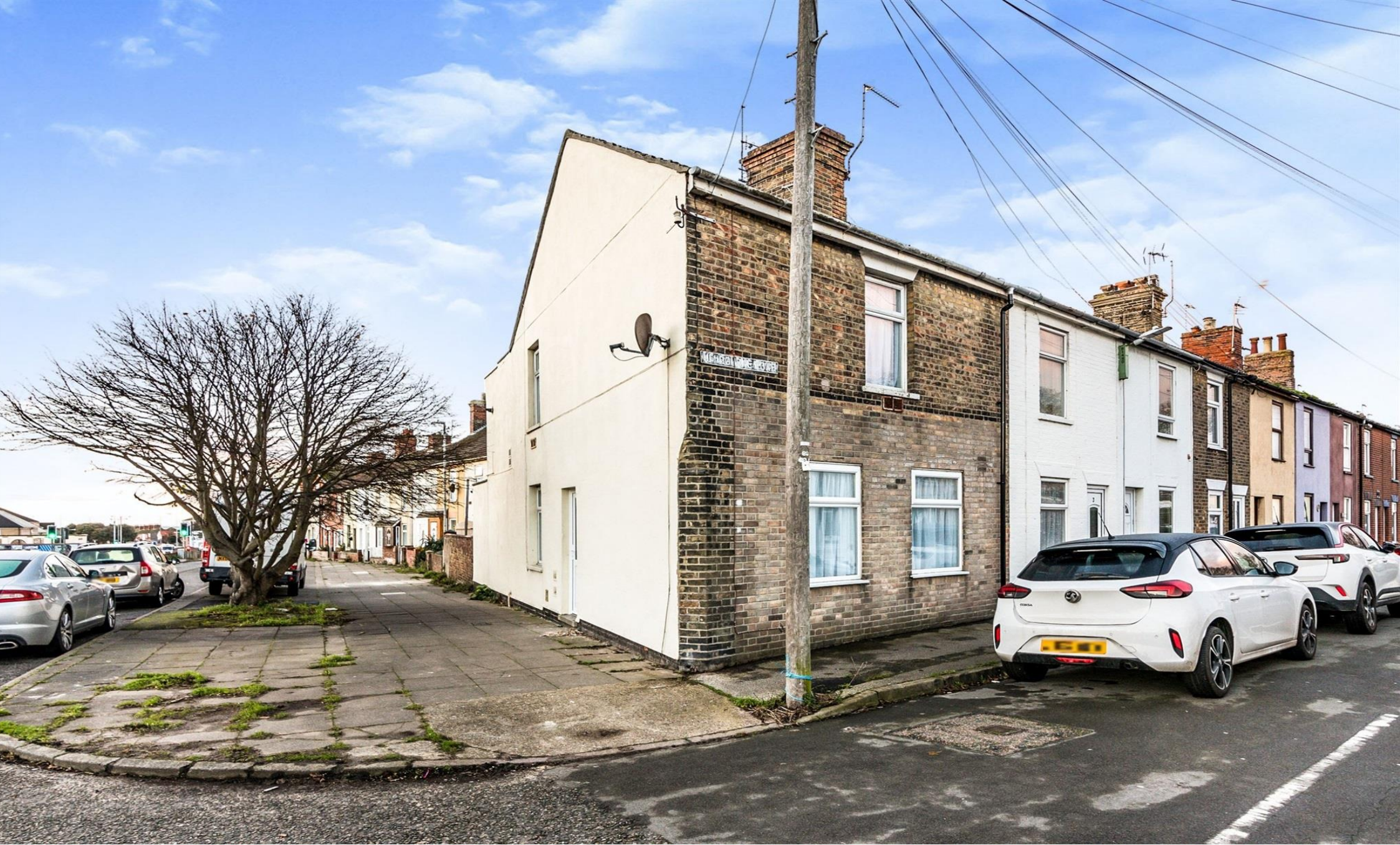
Melbourne Road, Lowestoft NR32 1SR