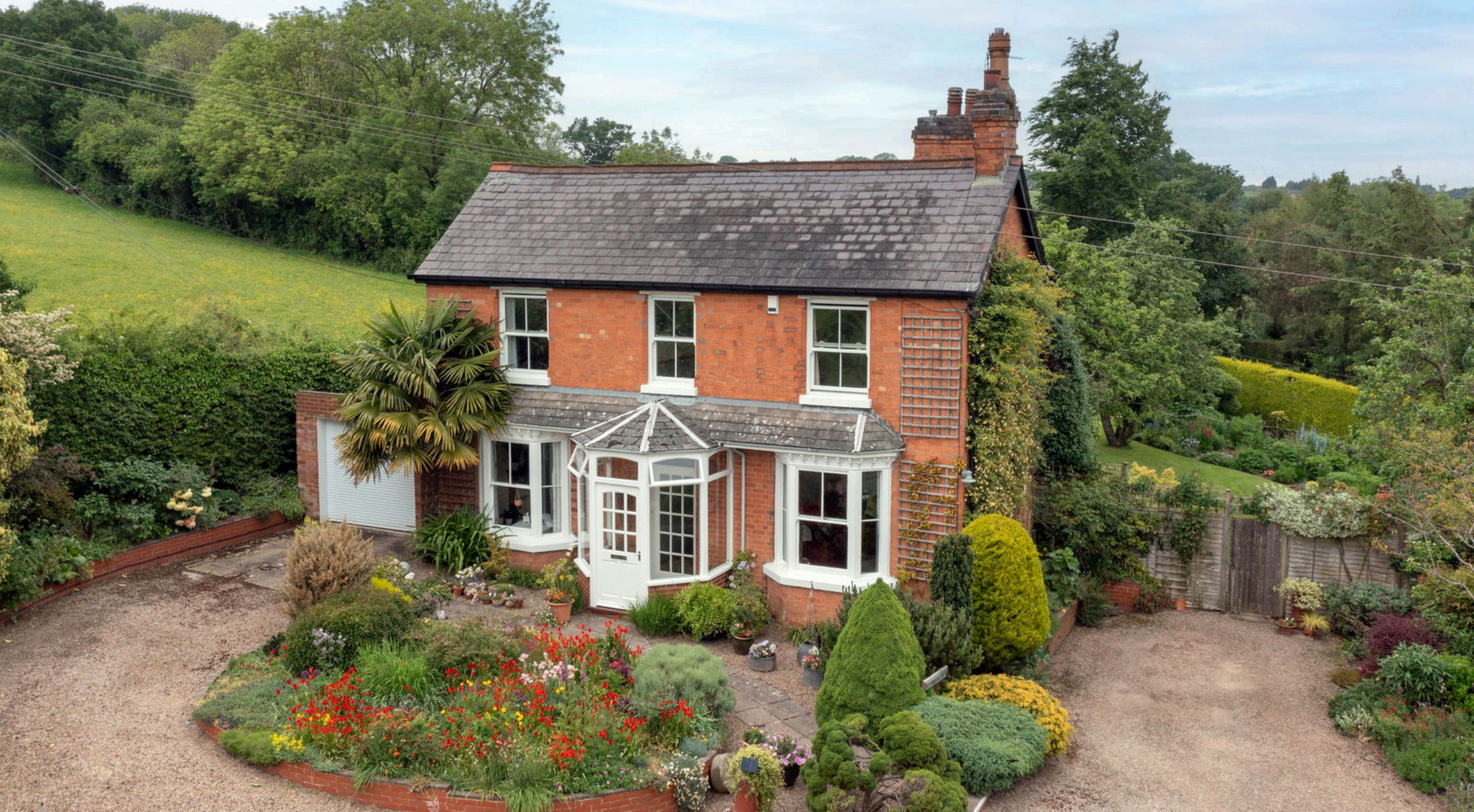
Hill Cottage, Scarfield Hill, Alvechurch, B48 7SF