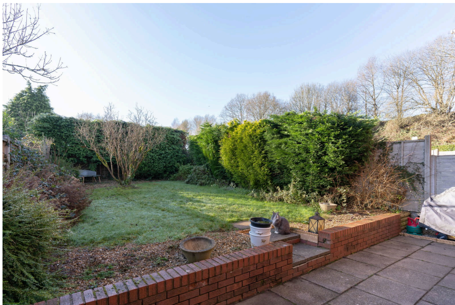
Margesson Drive, Barnt Green Ground Floor