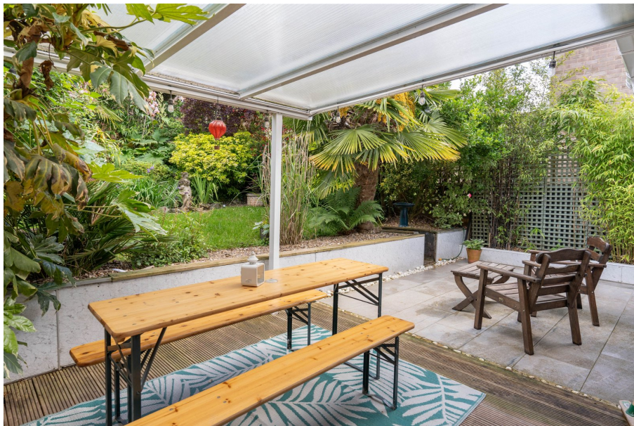
Ashmead Rise, Cofton Hackett Ground Floor