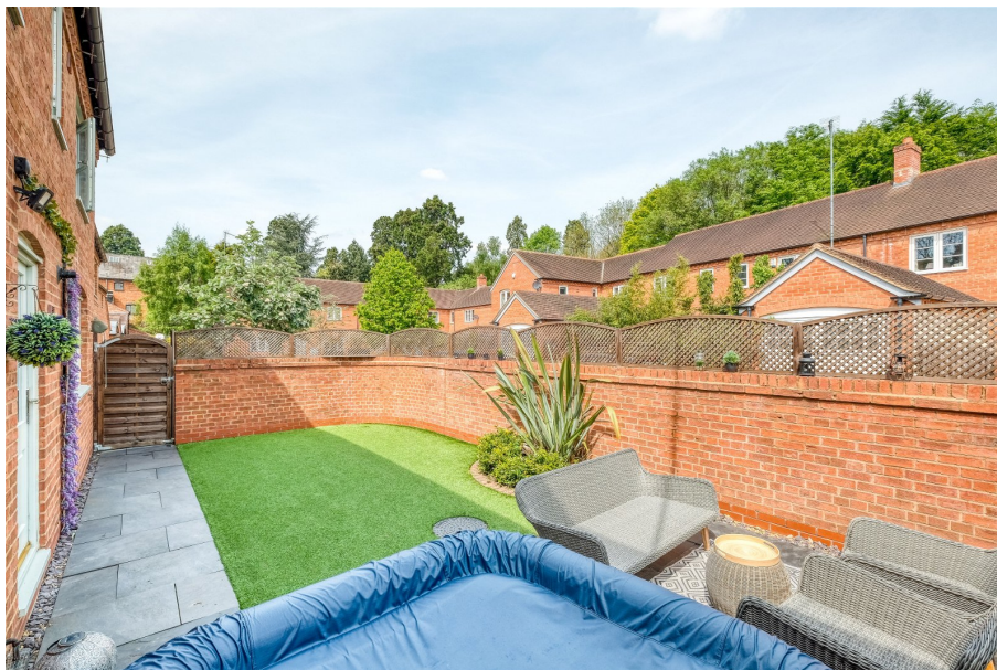
Mill Court, Alvechurch